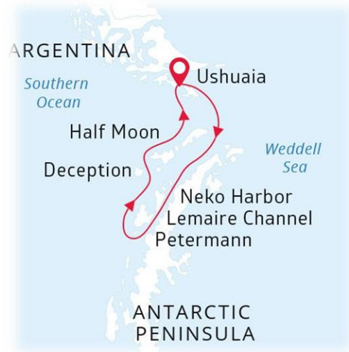
DECK PLAN M/V SEA SPIRIT