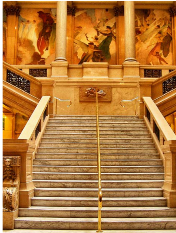
Grand Staircase of the Carnegie Museums

Foundation for Architecture, the Friends of Carnegie Library of Pittsburgh, the Pittsburgh History & Landmarks Foundation, and the Society for the Preservation of the Duquesne Heights Incline. In 1998 he authored the nomination that put Chatham Village Historic District on the National Register of Historic Places and assisted with the additional research that made it a National Historic Landmark in 2005. He has been a member of the National Trust since 1978 and served on the National Trust 2006 (Pittsburgh) Convention Committee.