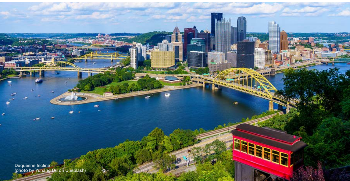
Duquesne Incline

Stay four nights at Pittsburgh's elegant Omni William Penn Hotel. Designed in a Renaissance Revival style, the hotel opened in 1916 and was the last building venture of industrialist Henry Clay Frick. After a multi-million-dollar renovation, the hotel offers Old World charm with modern touches, award-winning dining options, and traditional afternoon tea service.