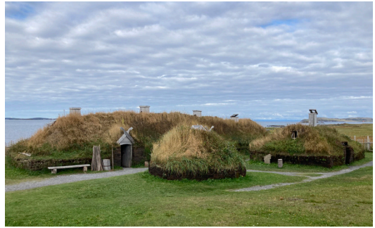
The reconstructed Viking settlement at L'Anse aux Meadows.

In the World Heritage site of L'Anse aux Meadows, walk among 11th-century Norse ruins and reconstructed sod huts and learn the saga of the Vikings who lived in North America nearly 500 years before Columbus arrived. (B,L,D)