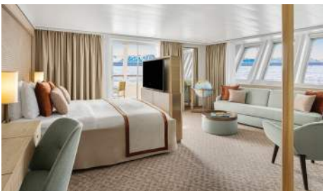
Category 7 suite with balcony.

All cabins and suites face outside with windows or portholes, and have a private bathroom and climate controls. Equipped with Wi-Fi, multiple electrical outlets, USB outlets, full-length mirror and phones.