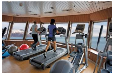
Fitness center with panoramic views.

Every staff member is committed to ensuring guests have an unforgettable experience. Many of the veteran guides and naturalists are locally based in your destination and have worked with the company for decades. A full-time medical professional, undersea specialist, National Geographic photographer and a National Geographic certified photo instructor are on board, and with a high staff-to-guest ratio, you can hear different perspectives and gain new insights every day.