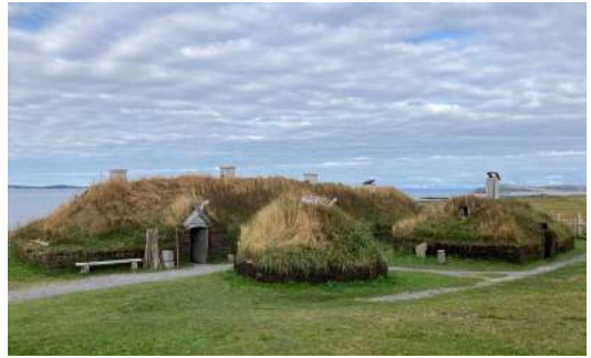
The reconstructed Viking settlement at L'Anse aux Meadows.

In the World Heritage site of L'Anse aux Meadows, walk among 11th-century Norse ruins and reconstructed sod huts and learn the saga of the Vikings who lived in North America nearly 500 years before Columbus arrived. (B,L,D)