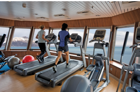
Fitness center with panoramic views.

Every staff member is committed to ensuring guests have an unforgettable experience. Many of the veteran guides and naturalists are locally based in your destination and have worked with the company for decades. A full-time medical professional, undersea specialist, National Geographic photographer and a National Geographic certified photo instructor are on board, and with a high staff-to-guest ratio, you can hear different perspectives and gain new insights every day.