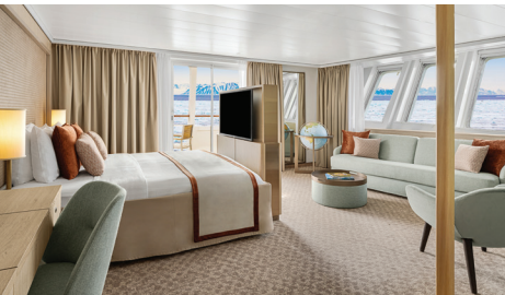
Category 7 suite with balcony.

All cabins and suites face outside with windows or portholes, and have a private bathroom and climate controls. Equipped with Wi-Fi, multiple electrical outlets, USB outlets, full-length mirror and phones.