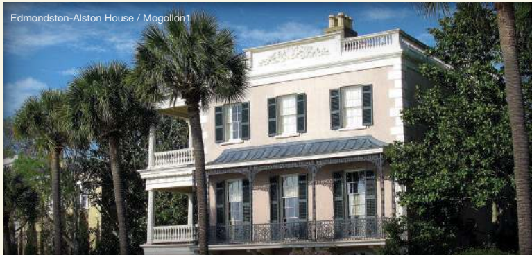
Edmondston-Alston House / Mogollon1