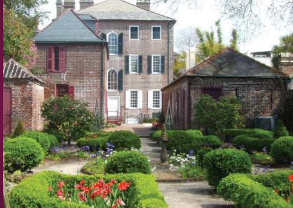
(left) Lantern Gate and (above) Nathaniel Russell House, Charleston, South Carolina