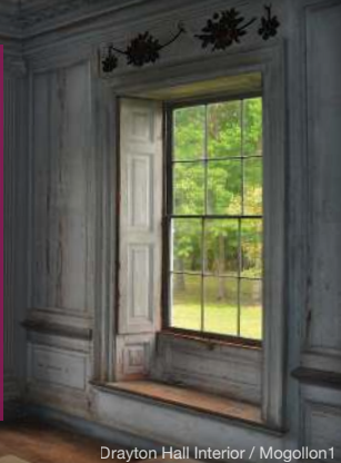
Drayton Hall Interior / Mogollon1