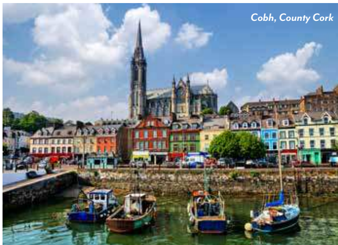
Cobh, County Cork

Arrive in Galway and select from two included excursions. On the first choice, admire the Wild Atlantic Way's dramatic splendor at the Cliffs of Moher and The Burren. Enjoy a guided walk across The Burren's karstic landscape and watch waves crashing below you at the breathtaking cliffs that rise 702 feet above the ocean. Your other option takes you to