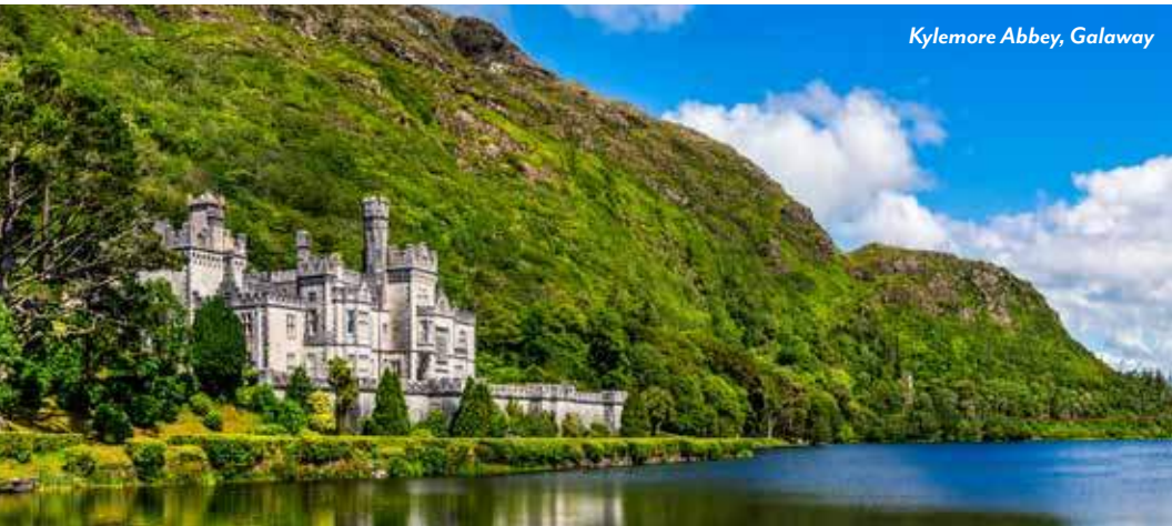
Kylemore Abbey, Galway

After breakfast, disembark and begin the County Kilkenny Post-Program Option or transfer to the airport for your return flight home. (B)