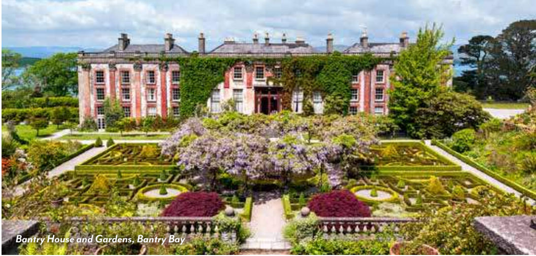
Bantry House and Gardens, Bantry Bay