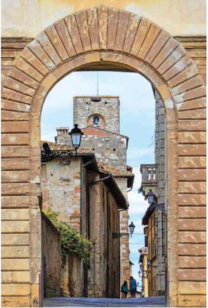
Colle di Val d'Elsa