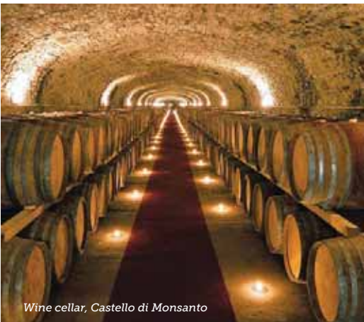
Wine cellar, Castello di Monsanto

Siena. Feel the warmth of storied Siena, the