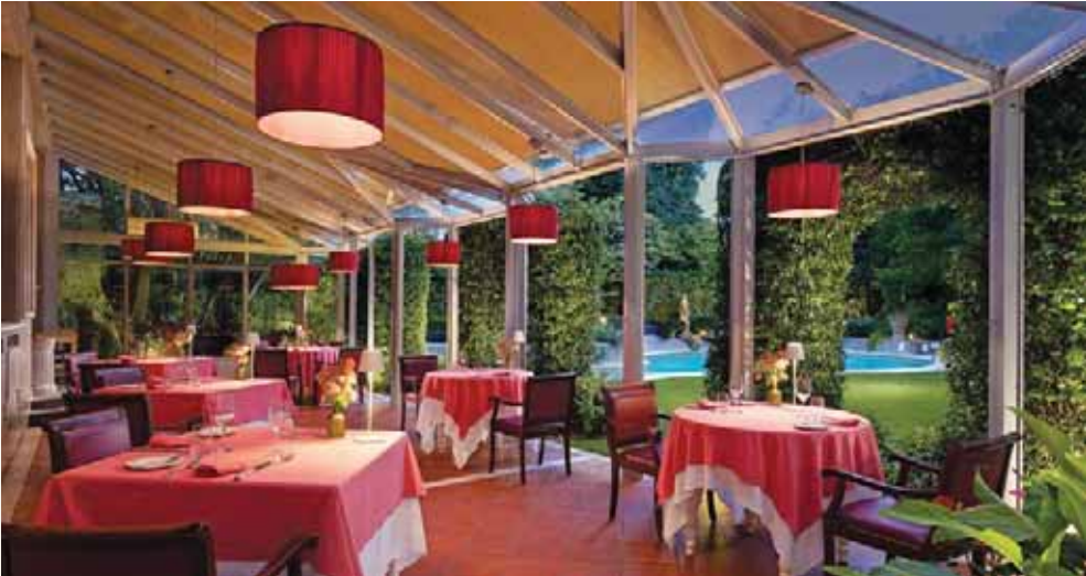
Sina Villa Medici | Florence