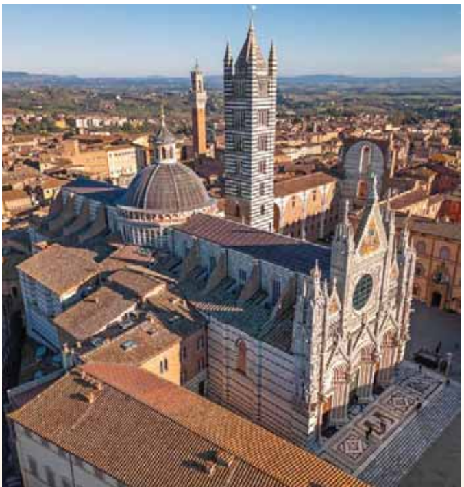
Cathedral of Santa Maria Assunta, Siena