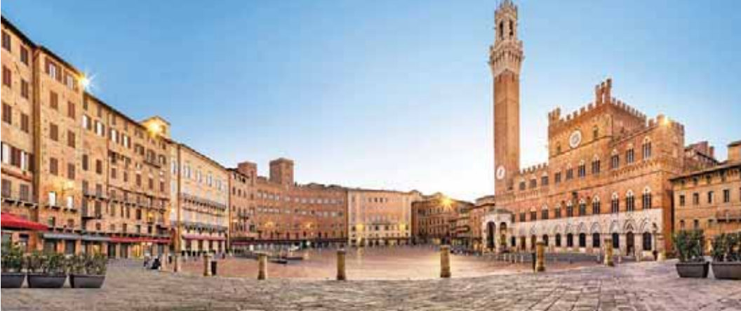
Piazza del Campo, Siena

featuring pieces by Antonio Stradivari, one of the world's greatest luthiers, and Bartolomeo Cristofori, the inventor of the piano.