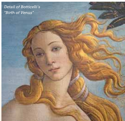
Detail of Botticelli's "Birth of Venus"