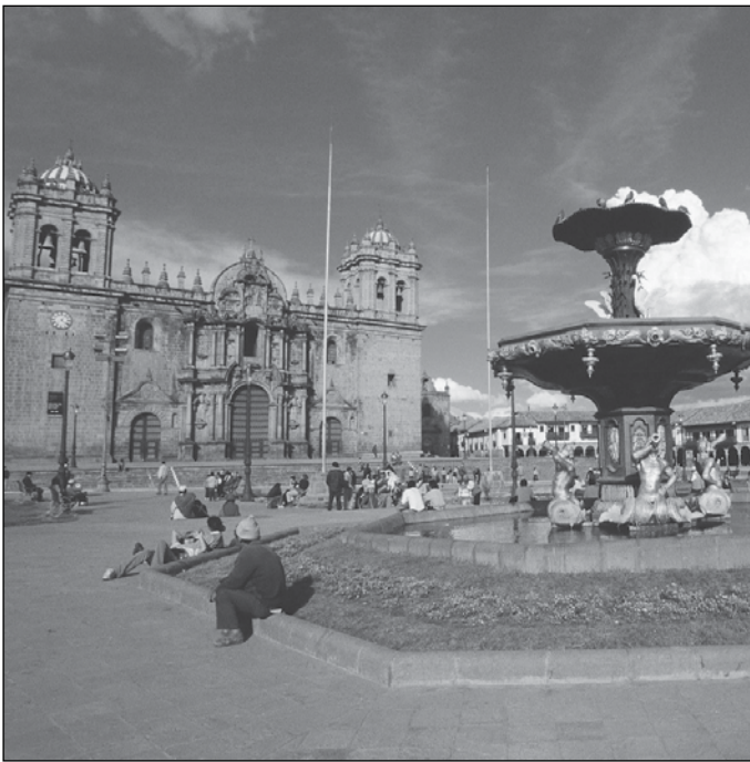
Step back in time while strolling through Cuzco's charming Plaza de Armas, flanked by splendid colonial architecture, including the magnificent Cathedral.

Then, experience the legendary marvel of Machu Picchu. Perched on an awe-inspiring mountain range in the Peruvian Andes, Machu Picchu was obscured from humankind for 400 years until Yale Professor Hiram Bingham literally stumbled upon it in 1911. A century of extensive research and study still has not revealed the secrets of its purpose, its residents or its abandonment; nevertheless, the site has been carefully excavated and preserved.