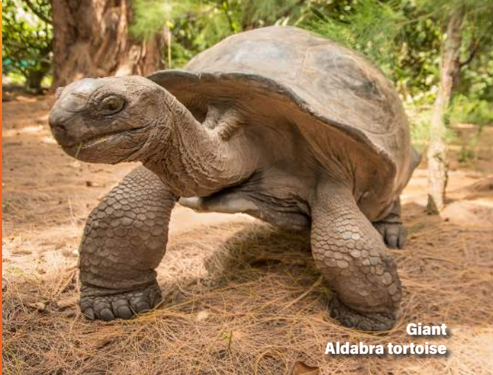
Giant Aldabra tortoise