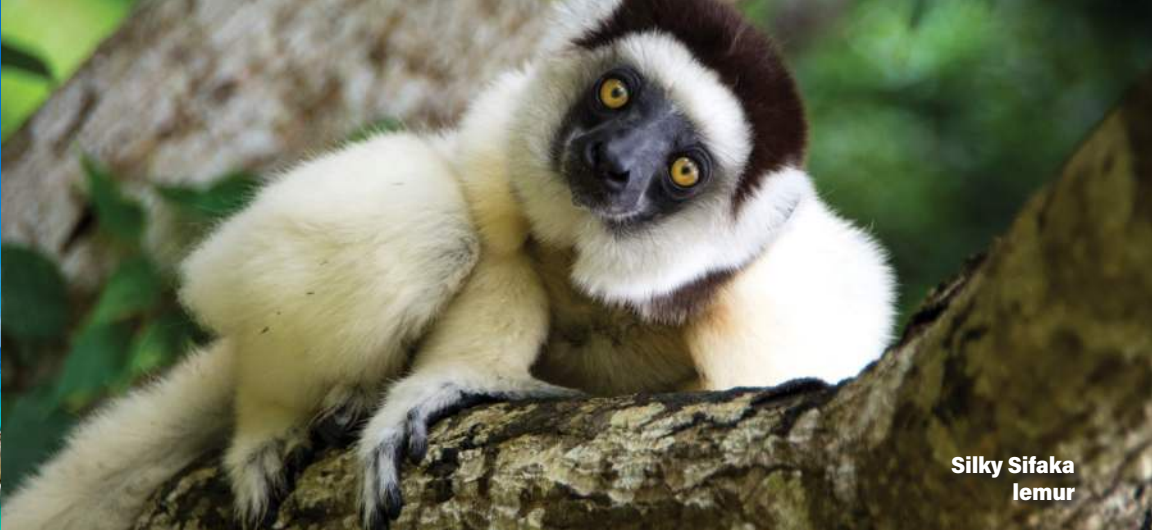
Silky Sifaka lemur