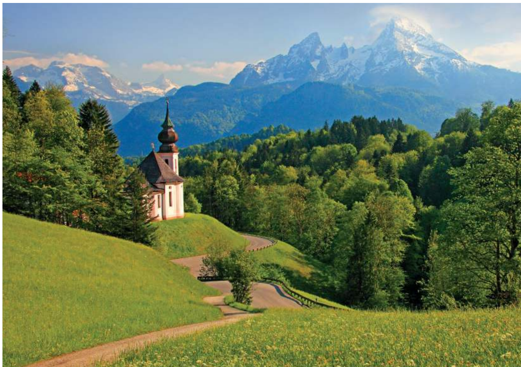
Majestic Alpine scenery surrounds us throughout our tour.

cross into northern Italy via the legendary Simplon Pass through the Alps. Late morning, we arrive in Stresa, Italy, along the shores of lovely Lake Maggiore, where we have time to explore and enjoy lunch on our own. Then a scenic drive through the famed Italian lake district returns us to Switzerland and our hotel in lakeside Lugano. B,D