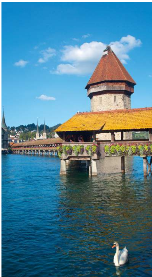
Lucerne’s beloved Kapellbrücke (Chapel Bridge)