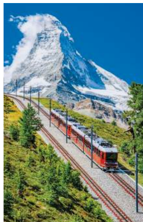
The Gornergratbahn railway

Day 12: Salzburg Our walking tour this morning features the geometrically-styled Mirabell Gardens, dating to the 17 th century; the Baroque Old Town, now a UNESCO World Heritage Site; and visits to Salzburg Cathedral and medieval Hohensalzburg Fortress, one of Europe’s largest and best-preserved castles. Then the remainder of the day is free for independent exploration. B