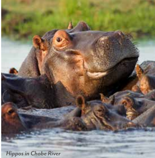
Hippos in Chobe River