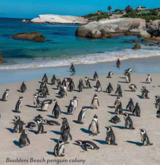
Boulders Beach penguin colony