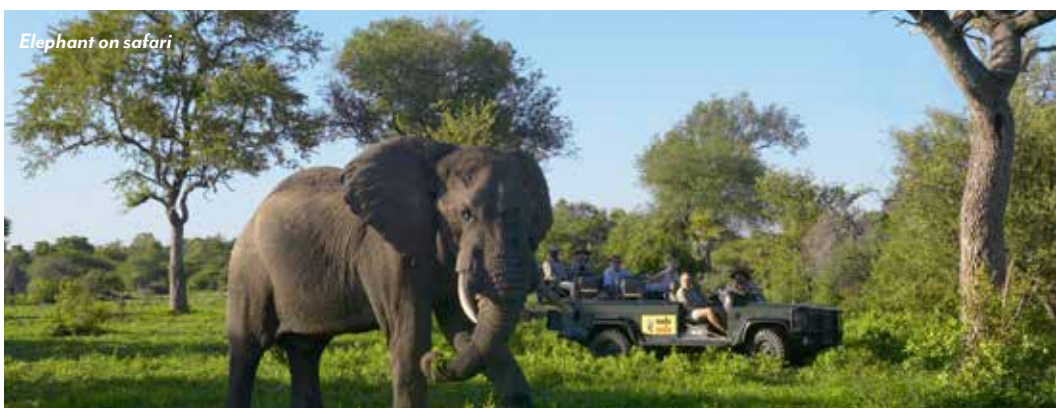
Elephant on safari