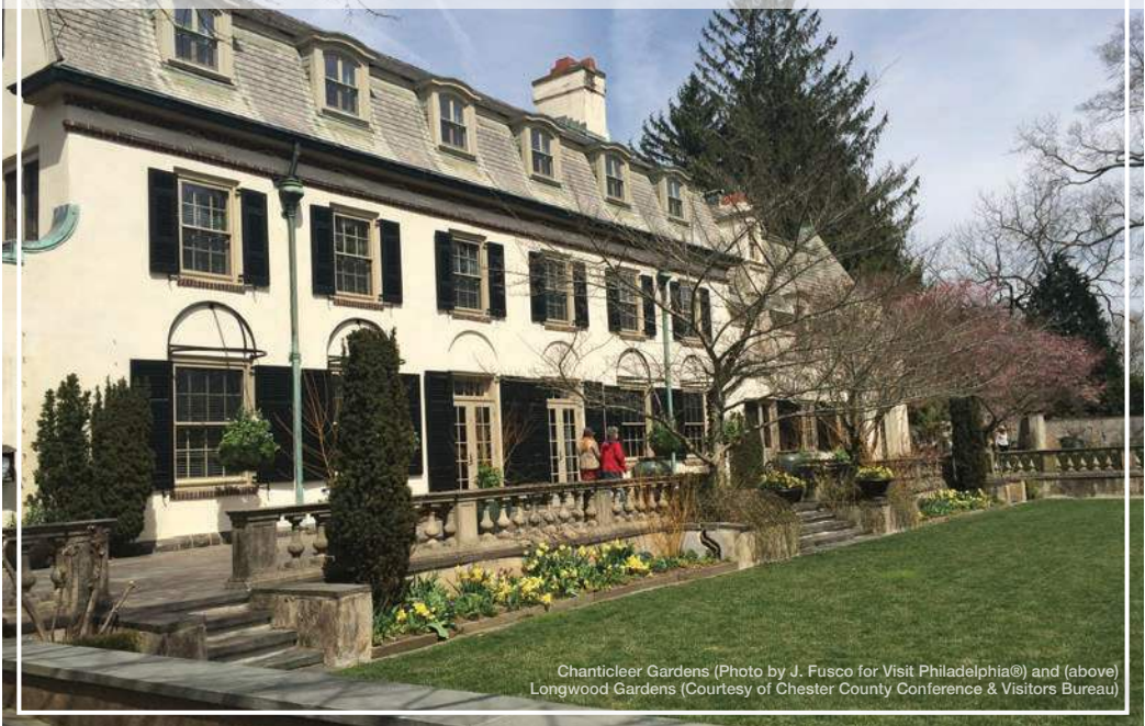
Chanticleer Gardens and (above) Longwood Gardens