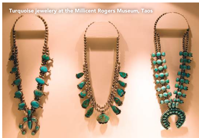
Turquoise jewelry at the Millicent Rogers Museum, Taos

Experience the genius of a leading 20th-century Apache sculptor at the Allan Houser Sculpture Garden , where more than 70 of Houser's monumental works dot the landscape against panoramic mountain vistas.