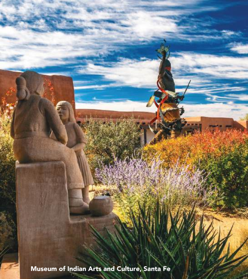
Museum of Indian Arts and Culture, Santa Fe