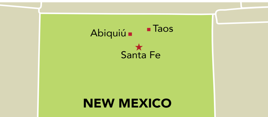
Map of the region

I hope you'll join this spring exploration of Santa Fe.