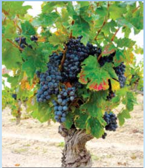
Grapes in a Provence vineyard