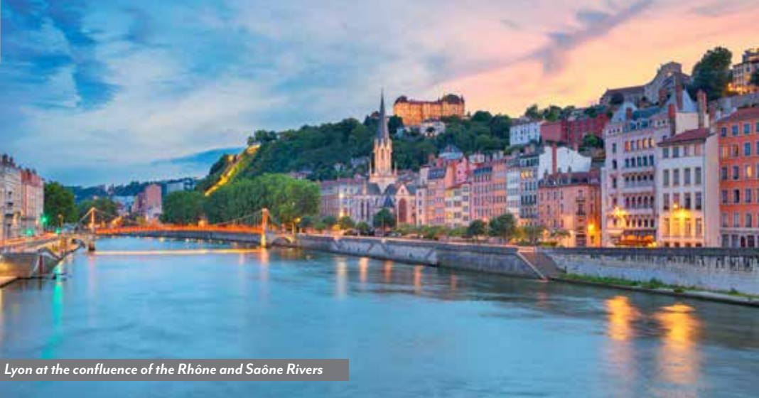
Lyon at the confluence of the Rhône and Saône Rivers