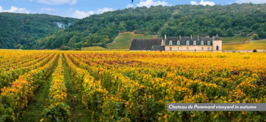
Chateau de Pommard vineyard in autumn

Provence's meticulously pruned vineyards and idyllic hillsides during the autumn harvest season form a mesmerizing backdrop for a living canvas, where a quaint streetside café in Arles once served as Van Gogh's muse, a 16 th -century castle has evolved into a renowned Beaujolais wine estate, and France's oldest Roman theater still stages performances in Lyon's Fourvière district. Experience southeast France's breathtaking landscapes, which remain forever entwined with the nation's achievements in fine art, cuisine, architecture, and literature.