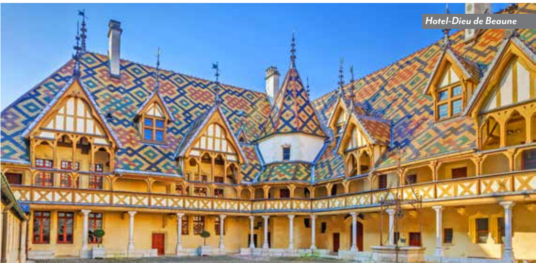
Hotel-Dieu de Beaune