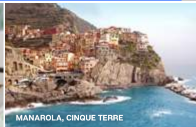
MANAROLA, CINQUE TERRE