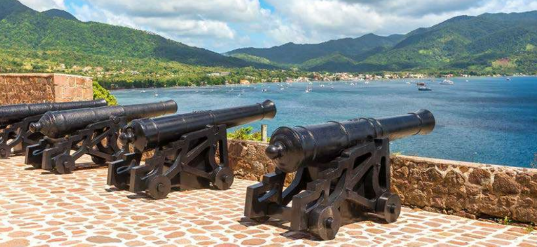
Cannons at Fort Shirley, Cabrits National Park, Dominica