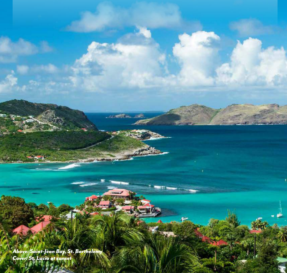
Above: Saint-Jean Bay, St. Barthelemy Cover: St. Lucia at sunset