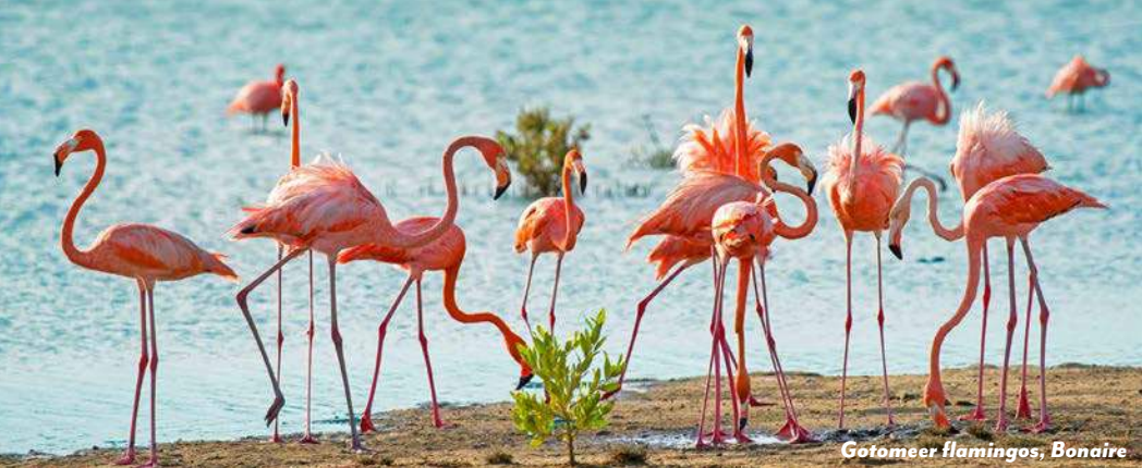
Gotomeer flamingos, Bonaire

Return to the ship for lunch and a relaxing afternoon on board.