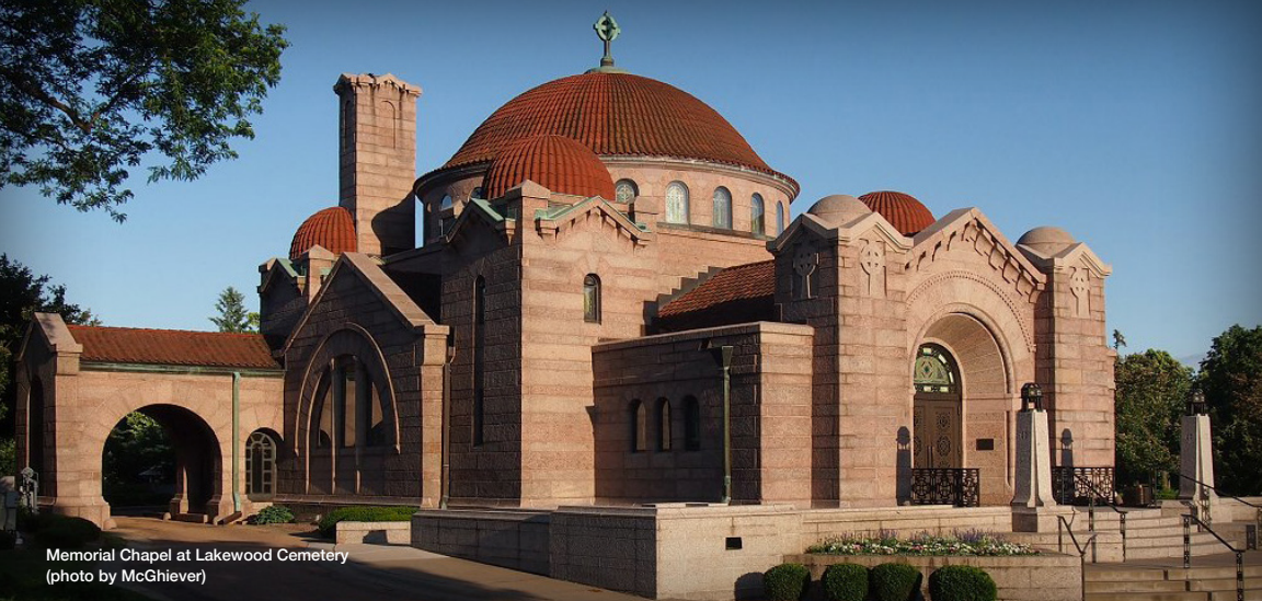
Memorial Chapel at Lakewood Cemetery