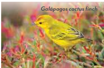
Galápagos cactus finch