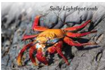
Sally Lightfoot crab