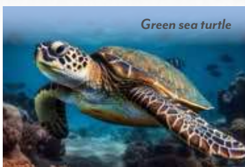
Green sea turtle

An astonishing vision of life without humans, the Galápagos Islands represent a truly unique environment. Located six hundred miles off the coast of Ecuador, the archipelago's isolation, combined with the nutrient-rich waters of the Humboldt Current, have created one of the world's richest marine ecosystems. Darwin's "living laboratory," the Galápagos Islands spurred the naturalist's paradigm-shifting work, On the Origin of the Species . Published in 1859, his speculations on natural selection in the role of "aboriginal creations, found nowhere else," inspired one of the most revolutionary scientific theories in history. One of the first and most treasured UNESCO World Heritage Sites, the Galápagos sustains an astounding number of endemic species, which continue to thrive with the absence of natural predators.