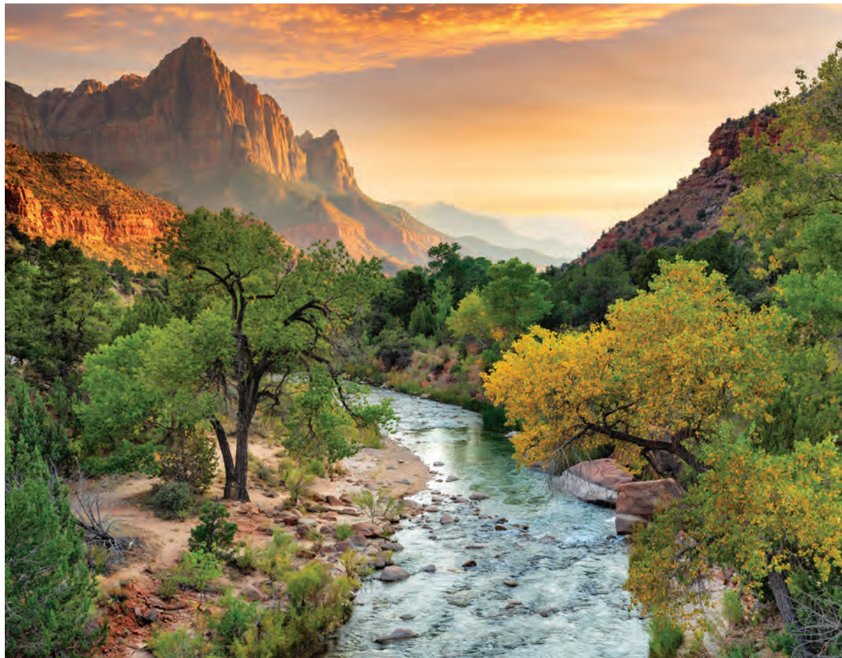
Zion NP's 232 square miles boast a diversity of landscapes, including high plateaus, deep sandstone canyons, and the Virgin River.