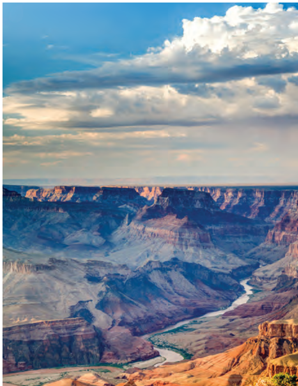
The Colorado and the Grand Canyon

Day 5: Grand Canyon/Page/Antelope Canyon/Lake Powell Today we travel to Page, Arizona, gateway to the imposing Glen Canyon Dam and its reservoir, Lake Powell. After reaching Page early this afternoon, we have lunch on our own then visit the sinuous – and spectacular – Upper Antelope Canyon. We travel onto Navajo land to reach this slot canyon, known to local tribes as “the place where water runs through rocks” – and one of the most photographed slot canyons in the world. Our tour through this stunning passageway reveals red-orange walls of “flowing” rock rising to heights of nearly 120 feet – the narrow canyon’s hard edges smoothed away by eons of water and sand erosion. We check in at our lakeside hotel this afternoon then enjoy dinner together there tonight. B,D