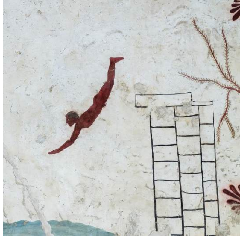
Tomb of the Diver, Paestum, Italy

After an exclusive welcome from the site director, you will see the three monumental temples dedicated to Hera and Athena, which are considered superior in their state of preservation to many in Greece itself.