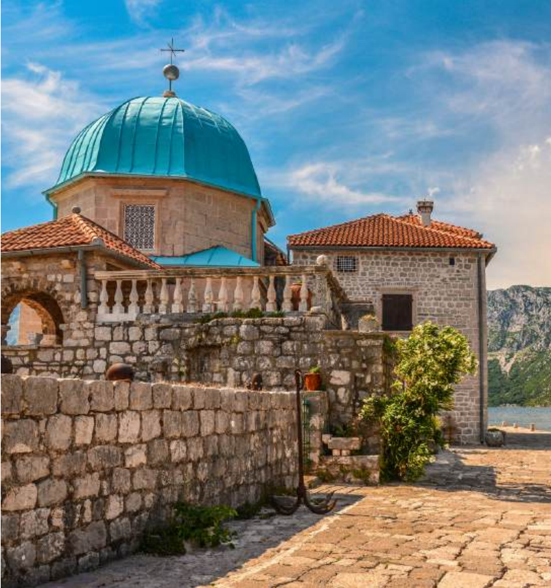
Our Lady of the Rocks, Kotor, Montenegro