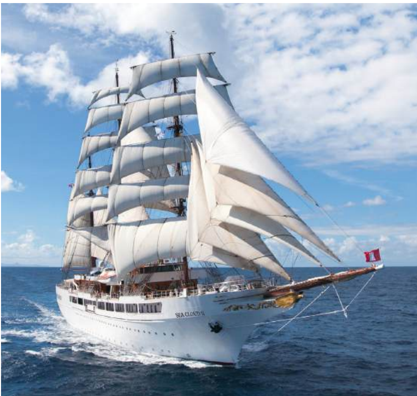
Sea Cloud II