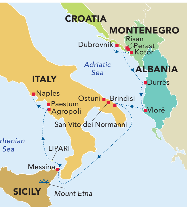
Old Town, Vlorë, Albania (top) and Map of the region (above)