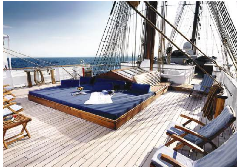
On Deck, Sea Cloud II

Sea Cloud II is a three-masted sailing yacht steeped in the elegance of yesteryear and complemented with the most modern amenities. Sister ship of the legendary Sea Cloud , Sea Cloud II has 47 outside cabins and travels under 23 billowing sails trimmed by hand. From the mahogany-paneled library and gracious lounge to the gym and watersports platform, no detail has been overlooked. Praised by the world's most discerning travelers, Sea Cloud II receives consistently high rankings from Condé Nast Traveler . Travelers enjoy open seating at all meals and complimentary use of all water sports equipment. A doctor is on call 24 hours a day. Please note that there is no elevator on Sea Cloud II .