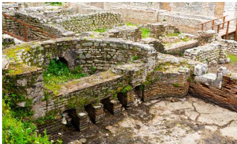
Roman Baths, Durrës, Albania

Option 1: Enjoy a guided tour of the historic city of Vlorë , beginning at the Muradie Mosque , a 1542 Ottoman masterpiece attributed to Mimar Sinan, the empire's greatest architect. Continue to the Museum of Independence , housed in the original headquarters where Ismail Qemali declared Albania's independence from the Ottoman Empire on November 28, 1912, ending nearly 500 years of rule.