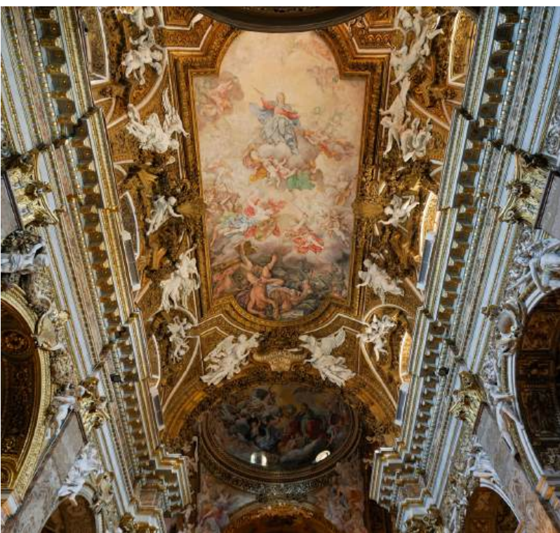
Basilica di Santa Maria della Vittoria, San Vito dei Normanni, Italy

Option 1: A morning in Messina illustrates the city's cycle of destruction and rebirth. You will visit the Messina Cathedral , a building that has been faithfully reconstructed multiple times following catastrophic earthquakes and fires, and see its bell tower, home to the world's most complex mechanical and astronomical clock.