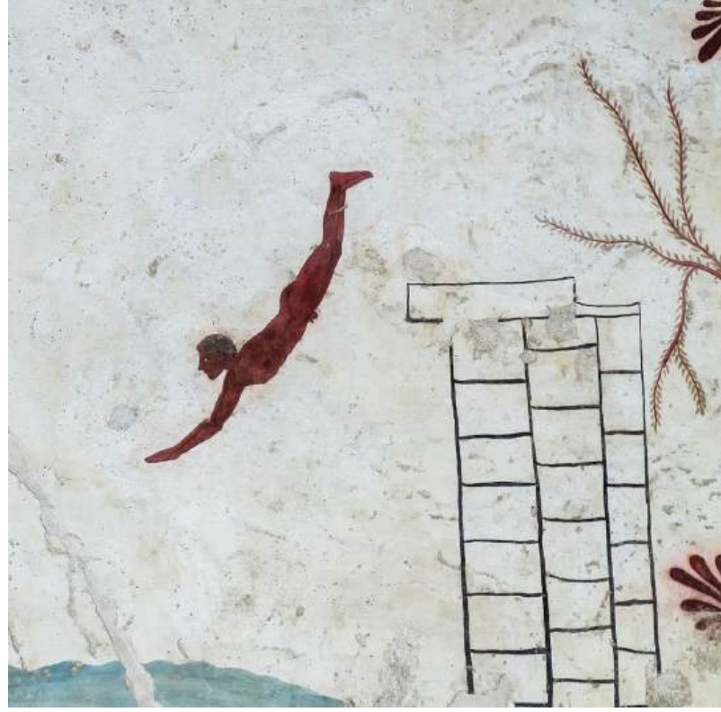
Tomb of the Diver, Paestum, Italy

After an exclusive welcome from the site director, you will see the three monumental temples dedicated to Hera and Athena, which are considered superior in their state of preservation to many in Greece itself.