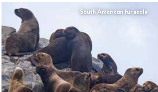
South American fur seals