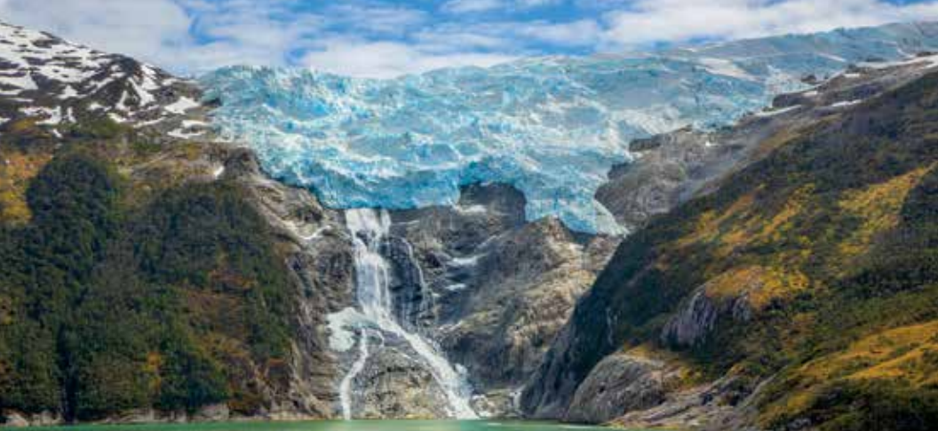
Glacial fjord of the Beagle Channel, Chile