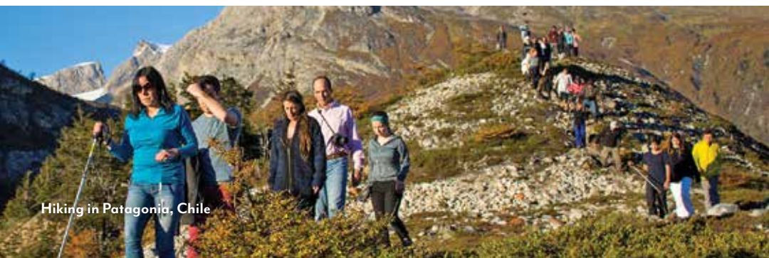
Hiking in Patagonia, Chile

Torres del Paine is South America's most celebrated national park and a UNESCO Biosphere Reserve. Observe its pristine landscape, brimming with spectacular glaciers, lakes and mountain ranges. Search for the region's iconic wildlife — ostrich-like rheas, pumas and guanacos. In nearby Milodón Cave, 1890s German pioneer Herman Eberhard discovered the prehistoric remains of a 13-foot giant sloth. Enjoy a hike along the gentle shores of Grey Lake, admiring the inspiring granitic towers and Grey Glacier. Relax over lunch in the park and survey its spectacular mountaintop views, including the three-peaked Cordillera del Paine. (B,L)