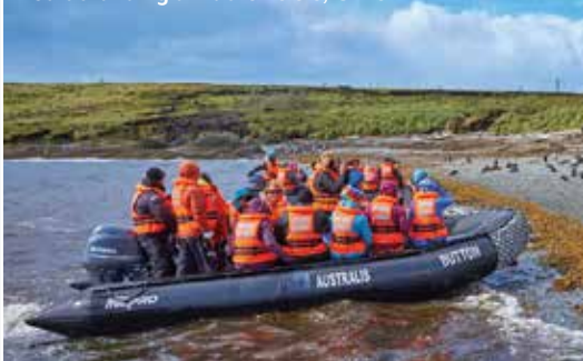
Zodiac landing at Tucker Islets, Chile

After breakfast, disembark in Ushuaia and fly to Buenos Aires to depart for your home city. Arrive home the next day. (B)