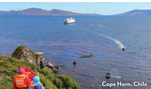
Cape Horn, Chile

While sailing toward Indonesia's fabled Spice Islands in 1520, Portuguese explorer Ferdinand Magellan became the first European to enter the channel that would later bear his name. Along the south side of the strait, amid the world's southernmost forests, smoke rose from numerous native Selk'nam campfires, leading Magellan to name this island Tierra del Humo, "land of smoke," which Spain's King Charles V changed to the more poetic Tierra del Fuego, "land of fire." The northern side of the strait came to be known as Patagonia, "land of giants," for Magellan and his men's impression of the tall, indigenous inhabitants. Three centuries later, the HMS Beagle, under the command of Admiral Robert FitzRoy and with young naturalist Charles Darwin on board, became the first ship to sail east to west through its namesake channel. Experience the same wonder as these intrepid explorers as you cruise through these mesmerizing landscapes, which have remained almost untouched since Magellan explored them nearly 500 years ago.