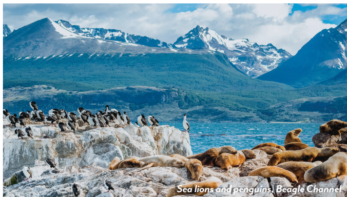
Sea lions and penguins, Beagle Channel