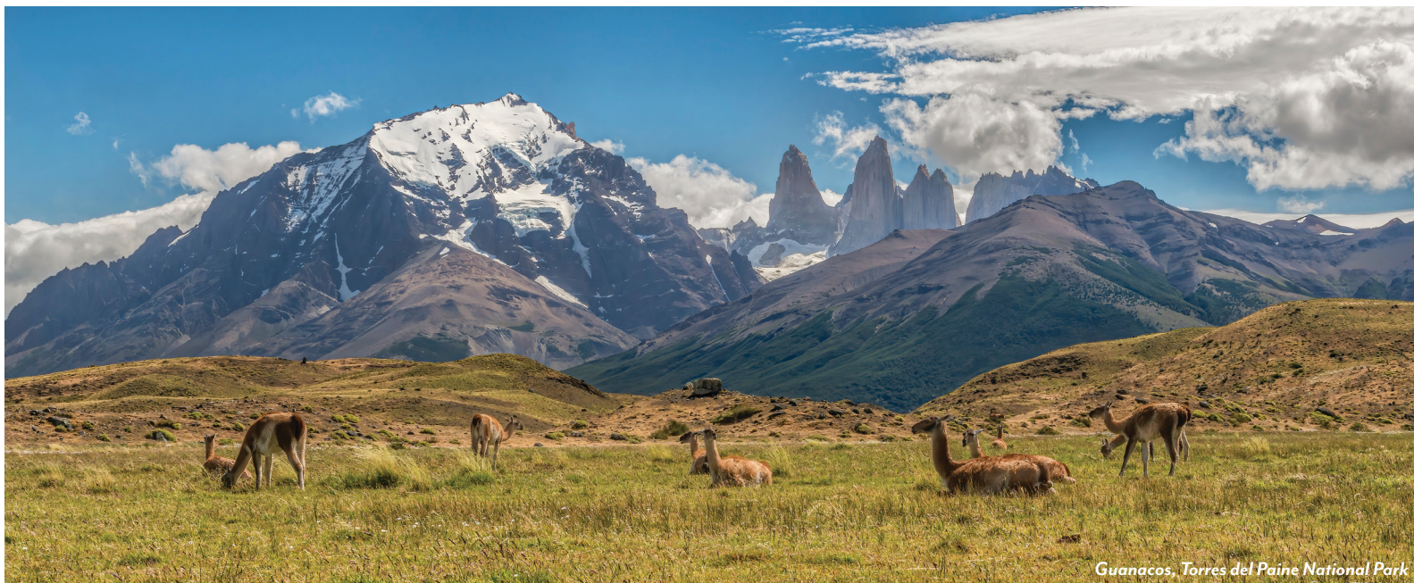
Guanacos, Torres del Paine National Park