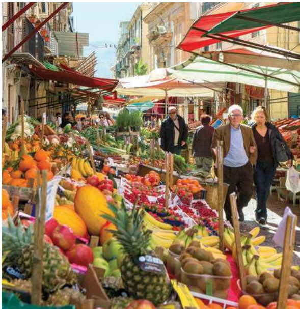
Colorful Sicilian street scene

Day 6: Agrigento This morning we visit the Valley of the Temples, a UNESCO World Heritage Site and archaeological zone whose ruins of fallen Doric temples and sanctuaries date to Greek rule in the 5 th century BCE. Known in its heyday as “the most beautiful city of mortals,” Agrigento was one of the leading cities during the Golden Age of ancient Greece. Our tour features both the eastern zone, where we see the beautifully preserved Temple of Concordia (c. 430 BCE), and the western zone, with the massive temple of Olympian Zeus, believed to be the largest Doric temple ever built. From the outdoor sites, we then move on to Agrigento’s archaeological museum, with exhibits and artifacts that tell the story of this outpost of classical Greece. Then we return to our hotel for a cooking lesson and dinner. B,D