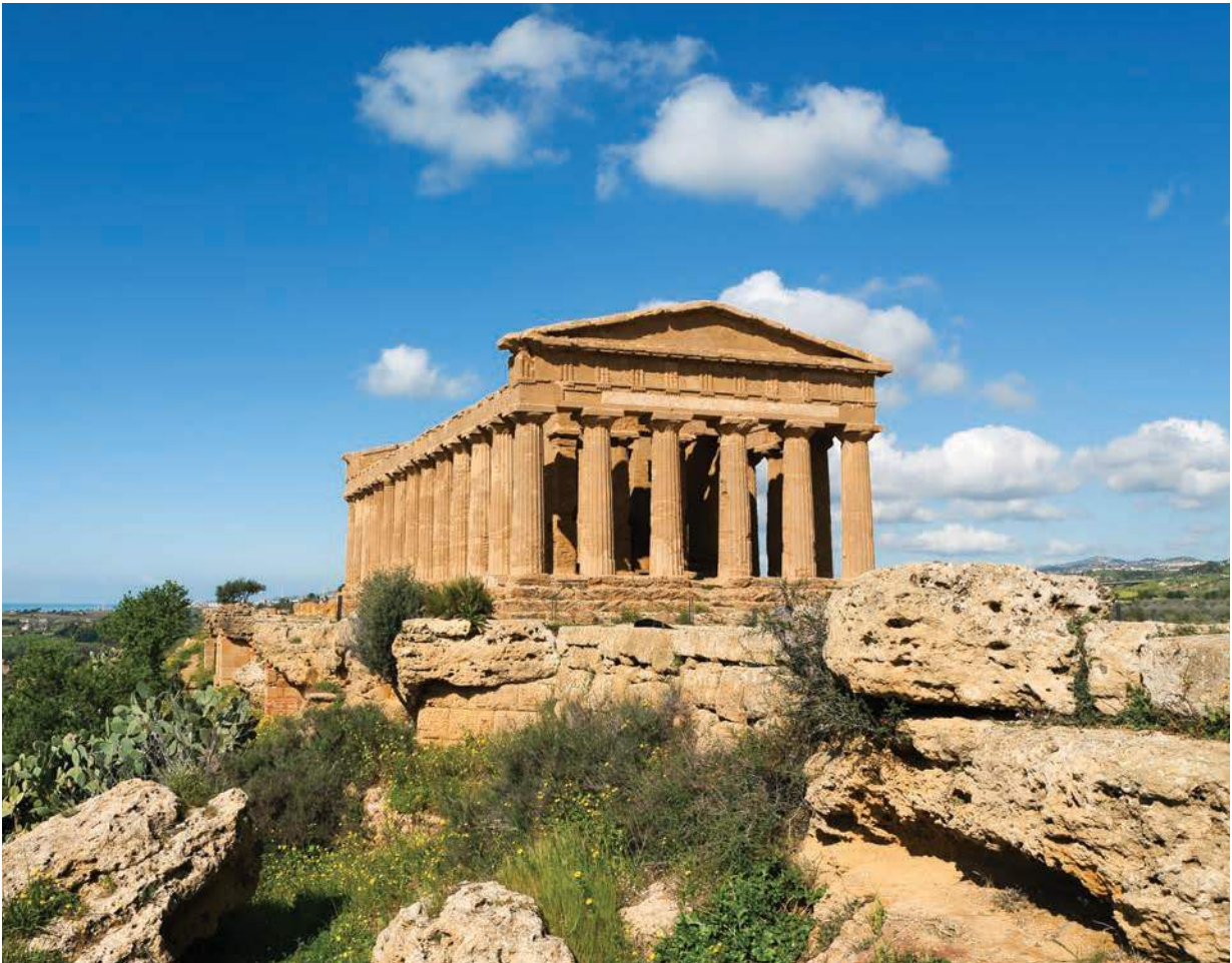
On Day 6, we explore the Valley of the Temples in hilltop Agrigento.