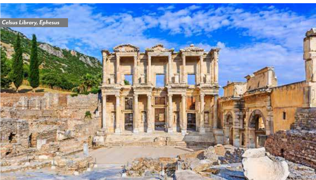
Celsus Library, Ephesus

Disembark and continue on the Thebes and Delphi Post-Program Option or transfer to the airport for your return flight home.