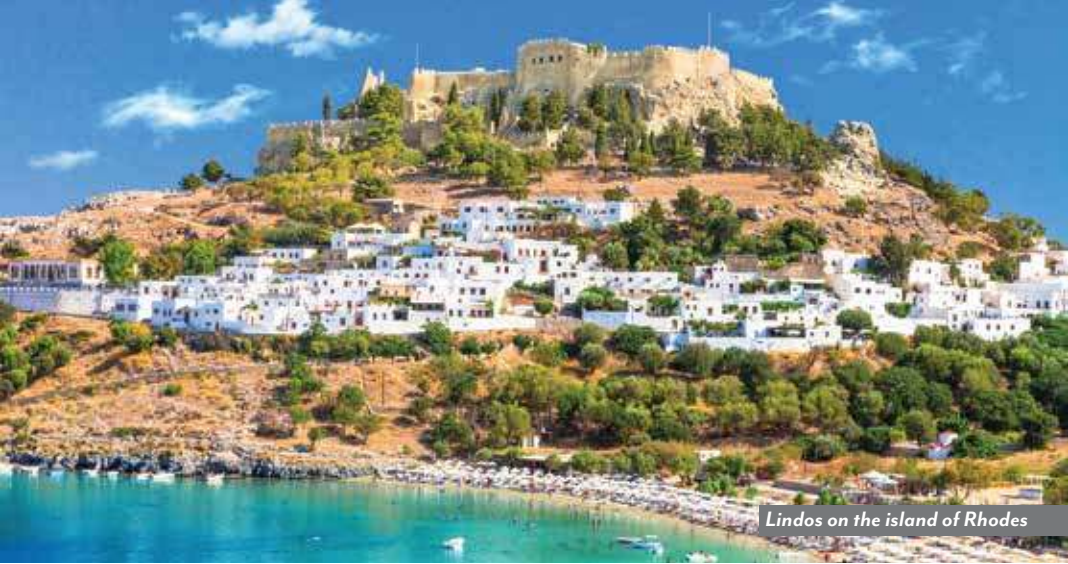
Lindos on the island of Rhodes