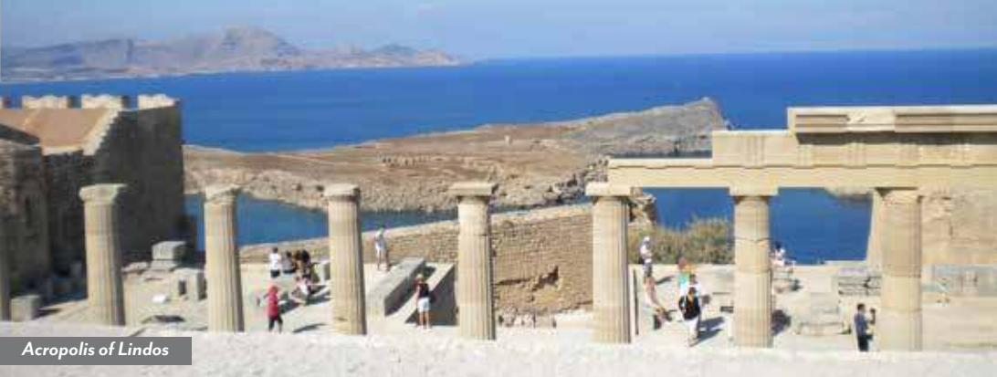
Acropolis of Lindos