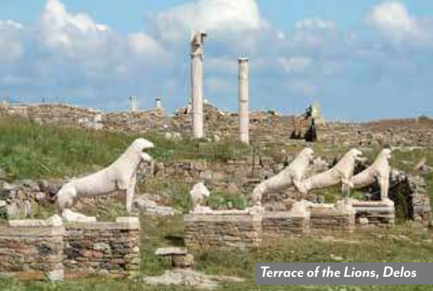
Terrace of the Lions, Delos