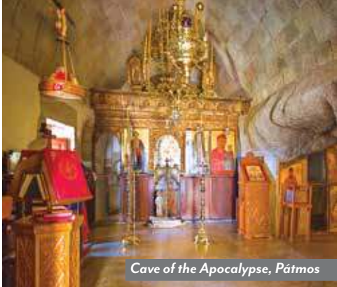
Cave of the Apocalypse, Pátmos

cliff-top acropolis or indulge in an afternoon at leisure in Rhodes. Enjoy a performance of traditional Greek music and dance this evening aboard the ship.