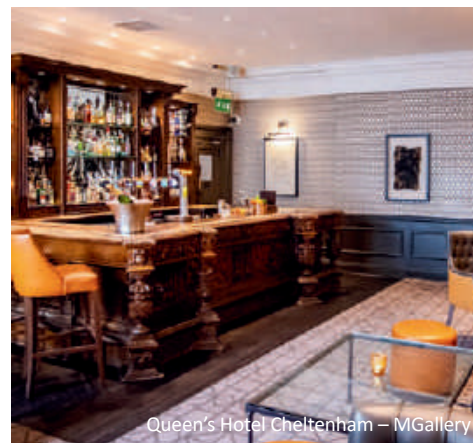
Queen's Hotel Cheltenham – MGallery