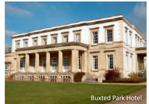
Buxted Park Hotel