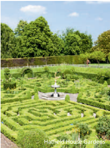
Hatfield House Gardens