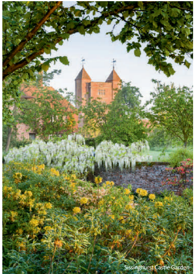
Sissinghurst Castle Garden