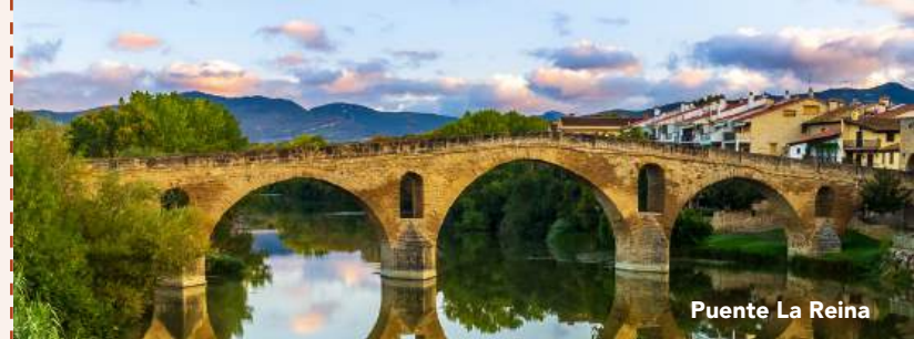
Puente La Reina

Operated by Arrangements Abroad | 260 West 39th Street, 17th Floor New York, NY 10018-4424 T: 212-514-8921 | 800-221-1944 | F: 212-344-7493