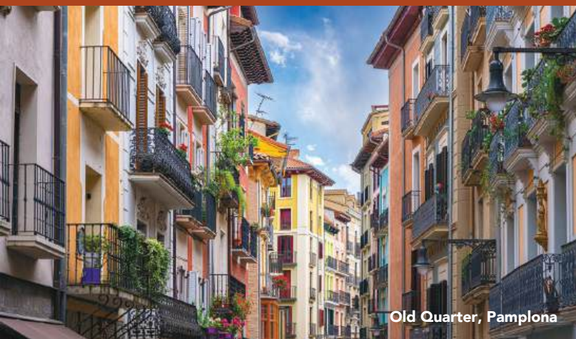
Old Quarter, Pamplona