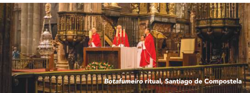
Botafumeiro ritual, Santiago de Compostela

Photos clockwise from top left: Hotel Villa de Laguardia, Laguardia; Parador de León, León; Parador de Villagranca del Bierzo, Villagranca del Bierzo; and San Francisco Hotel Monumento, Santiago de Compostela.