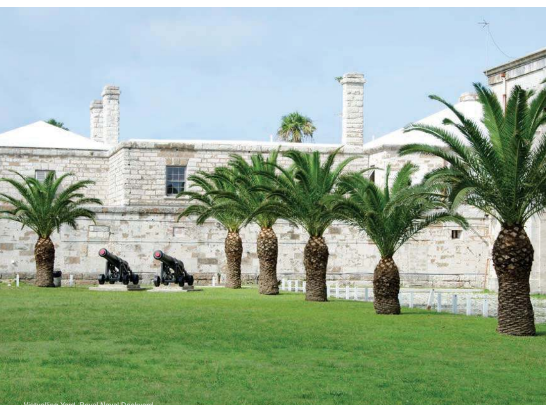
Victualling Yard, Royal Naval Dockyard

Dramatically situated overlooking Bermuda's southwest coast, the Pompano Beach Club has one of the best beachfront settings on the island with superb water views at every turn. Enjoy spacious, ocean-facing rooms, and unwind while enjoying sea breezes and ocean sunsets from your private balcony.