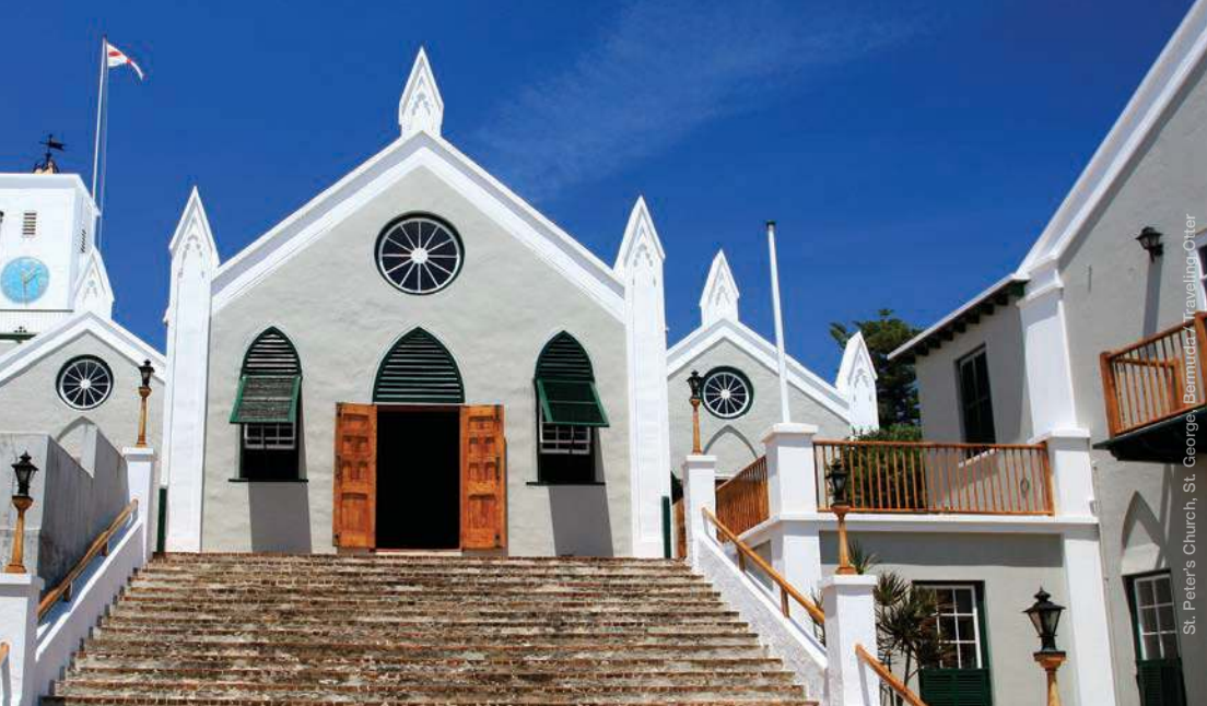
St. Peter's Church, St. George, Bermuda.