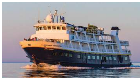
National Geographic Sea Bird.

An expedition ship is an ideal way to explore the Pacific Northwest. Traveling expedition-style allows you to experience the region with all your senses—seeing its grand beauty, hearing its waterfalls and wild silences, feeling its fresh air, and tasting it daily in the delectable, locally sourced food served aboard. You travel in comfort aboard the purpose built National Geographic Sea Bird , which features open decks, spacious cabins, generous windows, and an accommodating bow area. The 31-cabin ship is key to your experience. An onboard fleet of Zodiacs and kayaks are the perfect vehicles to have up-close views of the dramatic scenery of the Palouse River. Life aboard the ship is warm and welcoming. The lounge graciously accommodates the expedition community during nightly Recap and wine tastings, and the casual dining room serves meals in single seatings with unassigned tables for easy mingling.