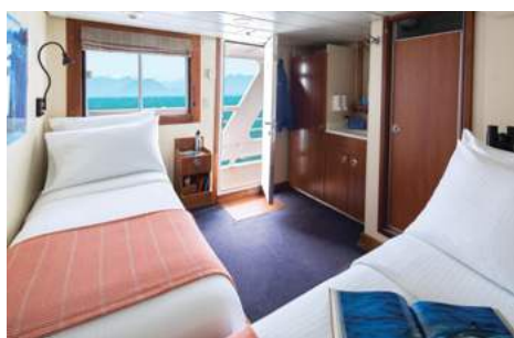
Category 2 cabin with single beds.

All cabins face outside with windows, private bathroom, and climate controls. Cabins are equipped with Wi-Fi and multiple electrical and USB outlets. Botanically inspired shampoo,