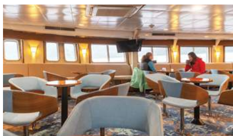
The lounge is the center of life aboard ship.

The ship features a library; global market; lounge with full-service bar and facilities for films, slide shows, and presentations; observation deck; partially covered sundeck with chairs and tables; and LEXspa. An open Bridge provides guests an opportunity to meet the officers and captain and learn about navigation.