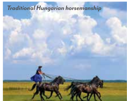
Traditional Hungarian horsemanship

The legendary Danube River is a powerful symbol of the diverse cultures and epic narratives of Central Europe. Fifth-century B.C. philosopher Herodotus declared it “the greatest of all rivers which we know” when Greeks traveled from the Black Sea through the naturally carved Iron Gates. The land was ruled by the Roman, Ottoman, and Byzantine Empires, creating intriguing capital cities along its banks. A channel for commerce, culture, and conquest, the Danube links the heartland of Central Europe with nations beyond the Black Sea. Our cruise through this fascinating region takes us to seven of the 10 countries where the mighty Danube flows—Austria, Slovakia, Hungary, Croatia, Serbia, Bulgaria, and Romania. The history and culture of these nations continue to inspire musicians, writers, artists, and travelers from all over the world.