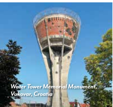
Water Tower Memorial Monument, Vukovar, Croatia

Embark on a tour of Belgrade, featuring Terazije Square and Temple of St. Sava. Visit Kalemegdan Fortress and the famous "House of Flowers" museum dedicated to former Yugoslavia's leader, Josip Broz Tito. (B,L,D)