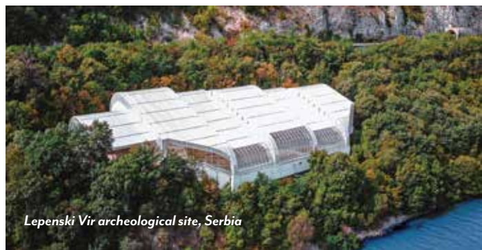
Lepenski Vir archeological site, Serbia