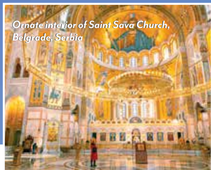
Ornate interior of Saint Sava Church, Belgrade, Serbia