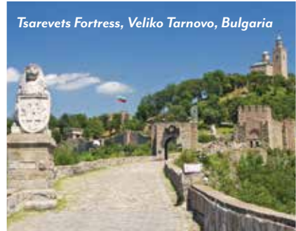
Tsarevets Fortress, Veliko Tarnovo, Bulgaria