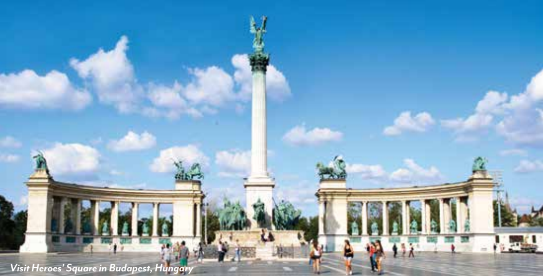
Visit Heroes' Square in Budapest, Hungary