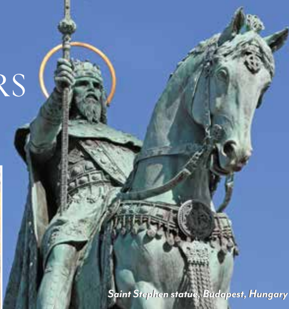
Saint Stephen statue, Budapest, Hungary