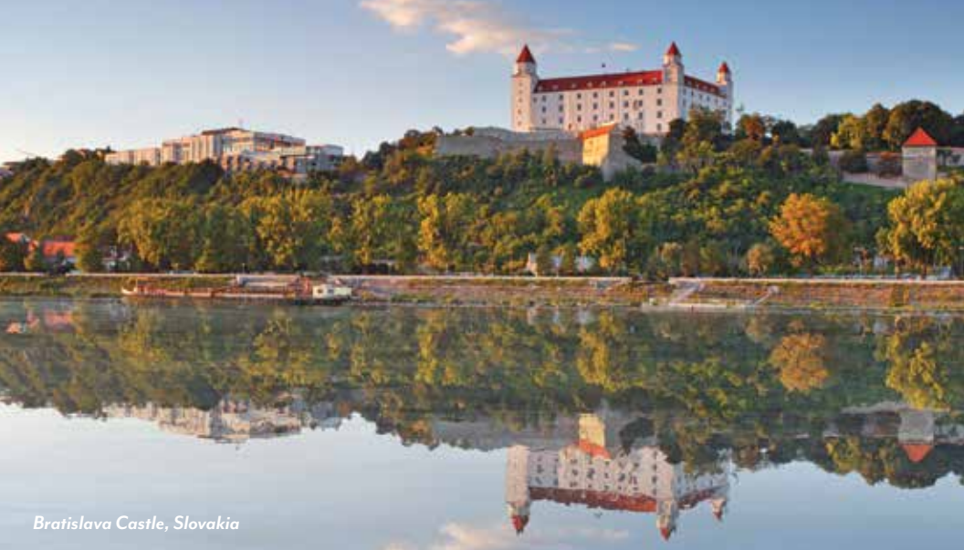
Bratislava Castle, Slovakia