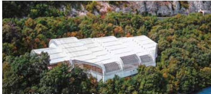
Lepenski Vir archeological site, Serbia