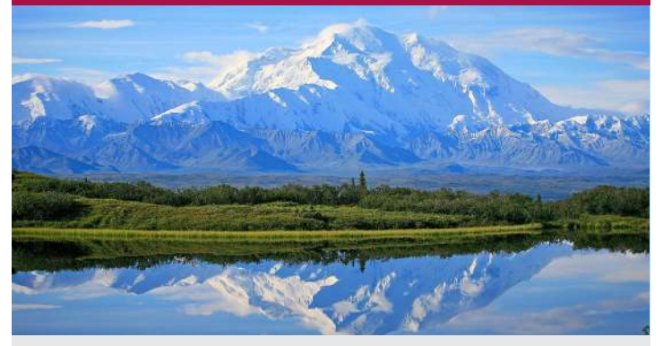
Denali National Park | 6 days, 5 nights August 10 to 15, 2026 | Program Begins: August 10