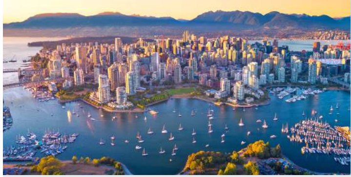
Vancouver | 3 days, 2 nights August 22 to 24, 2026 | Program Ends: August 25

All Program Features are contingent upon final brochure pricing. 2026