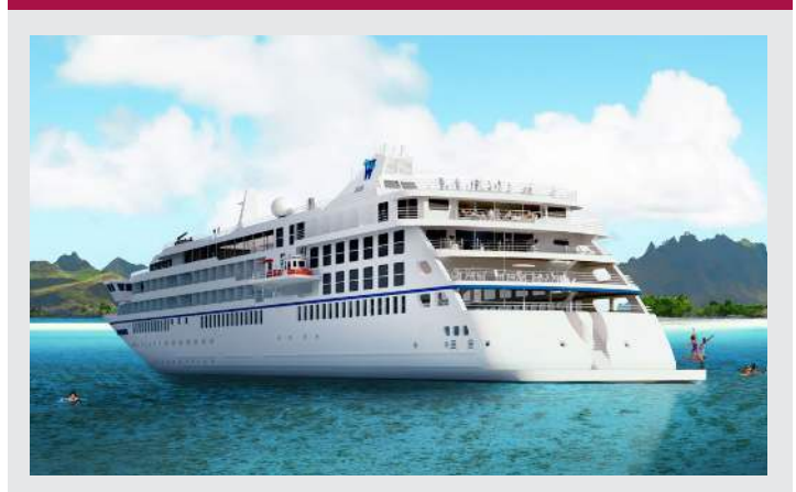
Star Seeker Exclusively Chartered, Deluxe Small Ship