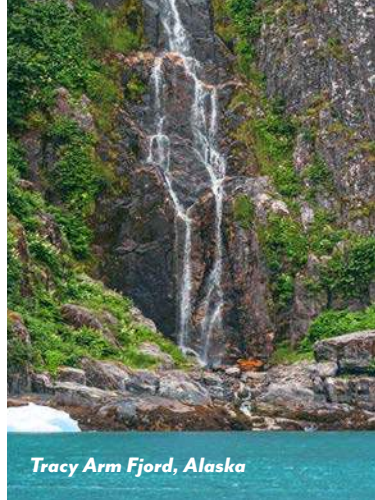
Tracy Arm Fjord, Alaska

beauty. The waterfront of Cow’s Bay is dotted with shops, restaurants, galleries and museums. Nearby is a bear sanctuary, and the waters offshore are filled with porpoises, seals and humpback and orca whales. Choose an included excursion: Take a city tour and visit the Museum of Northern British Columbia, known for its First Nations collection. Alternately, take a tour by vintage trolley, wrapping up at the charming City Sunken Gardens. Return to the ship for a delectable lunch. This afternoon, the ship enters the Inside Passage and cruises Grenville Channel.