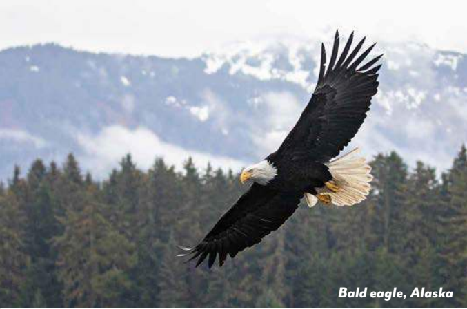
Bald eagle, Alaska