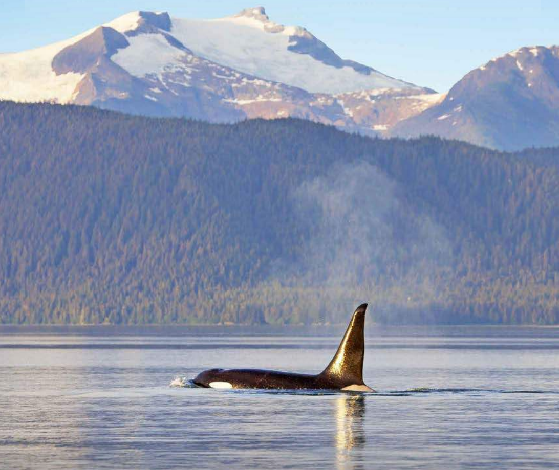
Above: Orca surfacing, Alaska Cover: Breaching humpback whale, Alaska

Photo Credits: AdobeStock, Alamy, ©WindStar, Shutterstock; all images are rights managed and cannot be used without permission.