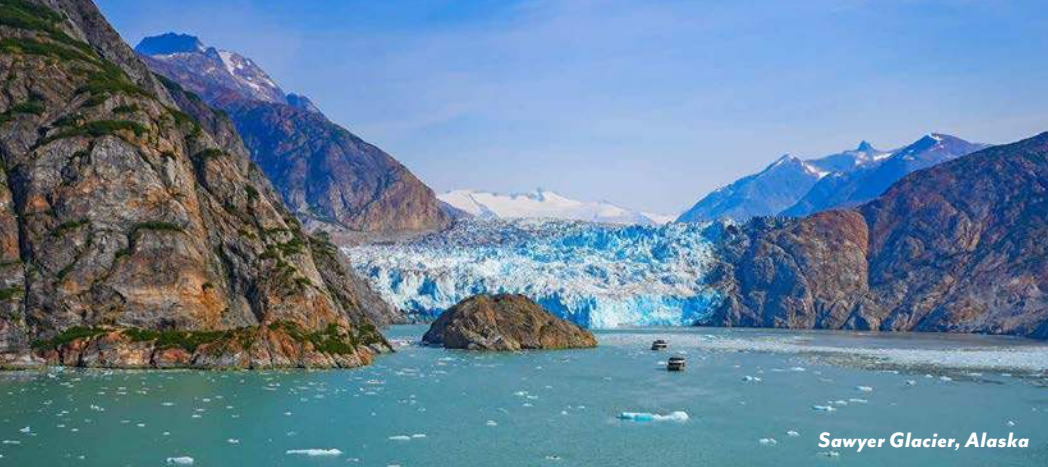
Sawyer Glacier, Alaska

Walk along the lush forest trail, spy the famous totems and watch demonstrations by native Alaskan artisans. Next, learn about the Alaska Raptor Center — and the eagles, hawks, falcons and owls they care for. Return to the ship for a tasty lunch, and spend the afternoon at leisure onboard.