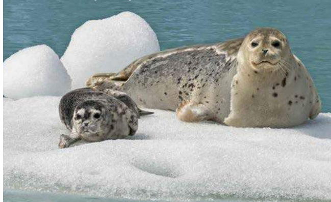
Harbor seals, Tracy Arm Fjord, Alaska