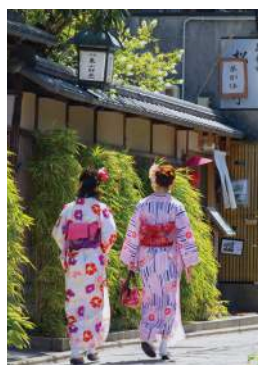
Geishas in traditional dress

Day 11: Kyoto More of Kyoto is on tap today, beginning with a visit to the otherworldly Arashiyama Bamboo Grove; the Kyoto Museum of Traditional Crafts (Fureaikan), showcasing all of Kyoto’s 74 different métiers in one place; and Nijo-jo Castle (c. 1603), the extravagant residence and fortifications of the shoguns who ruled Japan for more than 250 years. Then the remainder of the day is free for independent exploration in this traditional yet modern city. B