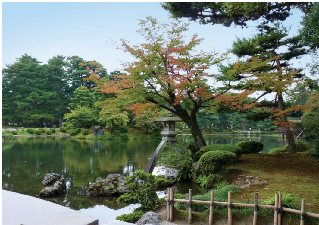
On Day 9 we visit Kenrokuen Garden, one of Japan's finest traditional gardens.

Day 6: Hakone/Takayama Today we travel first by bullet train then by Wide View Hida express train to lovely Takayama in the Japanese Alps, considered one of the country's most attractive towns with its 16 th -century castle and old-style buildings. Our explorations center on three narrow streets in the San-machi-suji district where, in feudal times, merchants lived amidst the authentically preserved small inns, teahouses, and sake breweries. This afternoon we attend a traditional Japanese tea ceremony here, an historic ritual of form, grace, and spirituality. B,D