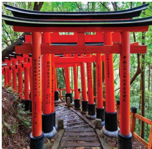
We visit Kyoto's Fushimi Inari shrine on Day 12.

Day 12: Kyoto We continue our encounter with Kyoto today, first at the important Fushimi Inari shrine, with its trails straddled by red torii gates; Sanjusangendo Hall (c. 1266), an important Buddhist