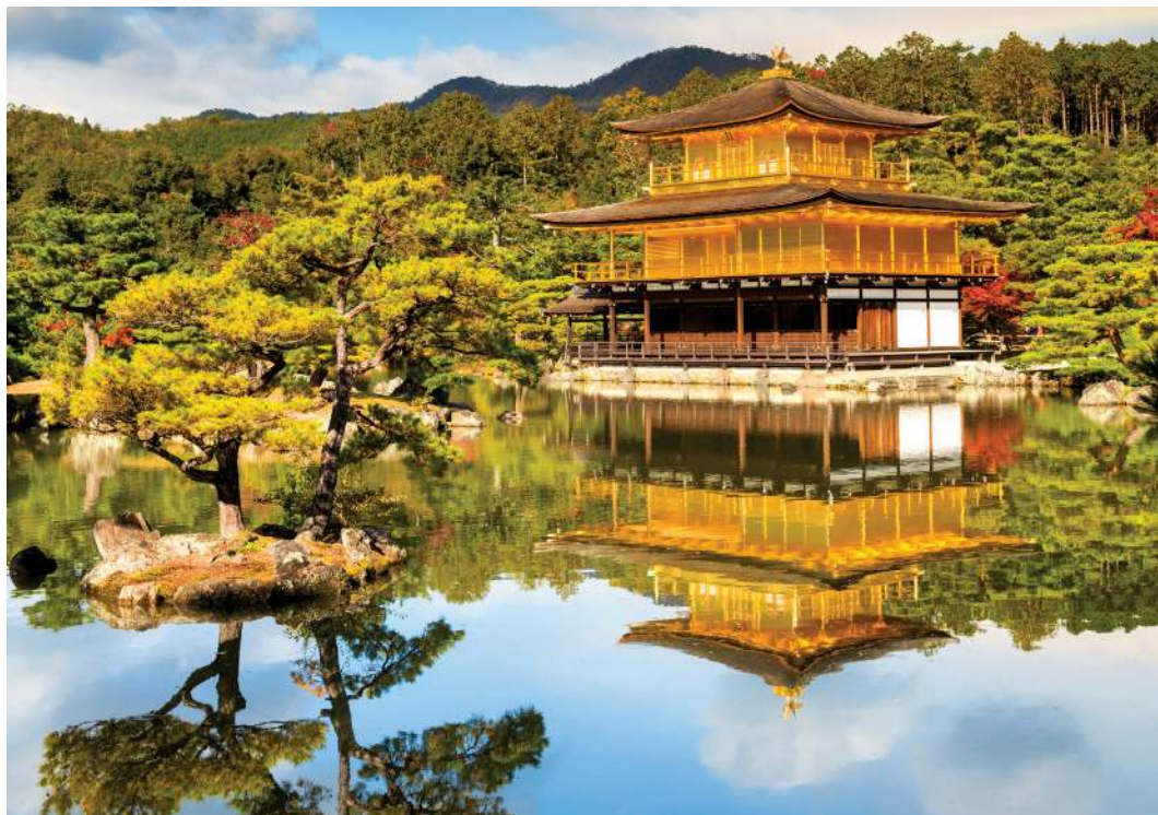
We visit Kyoto's Temple of the Golden Pavilion on Day 10.

Day 6: Hakone/Takayama Today we travel first by bullet train then by Wide View Hida express train to lovely Takayama in the Japanese Alps, considered one of the country's most attractive towns with its beautifully preserved Old Town. Our explorations center on three narrow streets in the San-machi-suji district where, in feudal times, merchants lived amidst the authentically preserved small inns, teahouses, and sake breweries. This afternoon we attend a traditional Japanese tea ceremony here, an historic ritual of form, grace, and spirituality. B,D