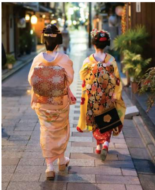
Geishas in traditional dress

temple housing 1,000 statues of the Thousand-Armed-Kannon deity; and Nishiki Market, "Kyoto's Kitchen" of restaurants, stores, and stalls selling everything food-related. Then this afternoon is at leisure; tonight, we toast our adventure at a farewell dinner at a local restaurant. B,D