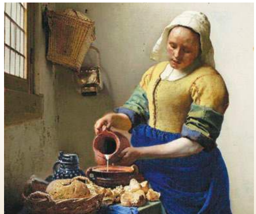
Right: The Milkmaid , Johannes Vermeer, Rijksmuseum, Amsterdam