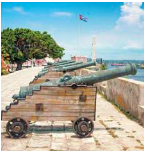
Cannons at fortification, Havana