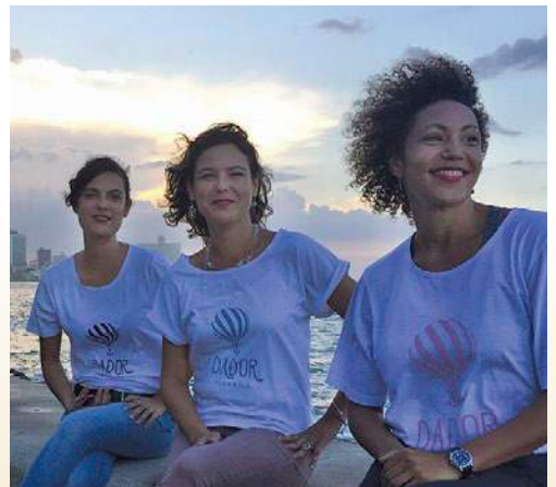
Founders and owners of Dador

Later today, visit the Ludwig Foundation, a nonprofit cultural institution that is dedicated to protecting and promoting Cuban artists.