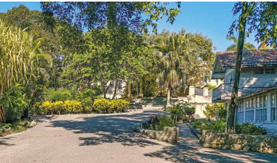
La Finca Vigia museum, Ernest Hemingway's home

Meet independent local artists and learn about their desires to pursue artistic ventures. Sit down to dinner at the Hotel Nacional.