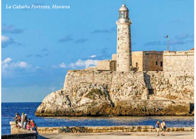
La Cabaña Fortress, Havana