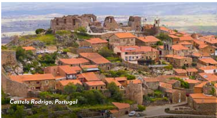
Castelo Rodrigo, Portugal