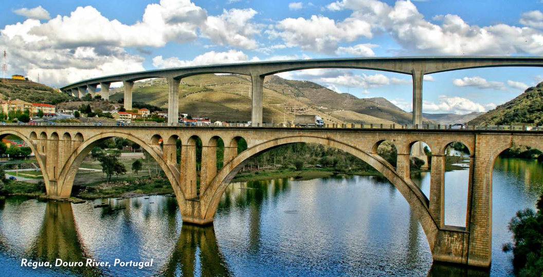
Régua, Douro River, Portugal

and memorable highlight. After lunch, visit the ancient and picturesque town of Lamego, which produces wines, fruit and smoked meats. Stroll the cobblestoned streets and the town's wide boulevard, lined with cafes and market stalls. Lamego is home to one of the most important pilgrimage sites in Portugal, the Nossa Senhora dos Remédios, set on a spectacular hilltop. The church is accessed by a Baroque double staircase of 686 steps and nine terraces, decorated with statues, azulejos and urns. The views at the top are spectacular! End the day with a tasting of local specialties and wines. (B,L,D)