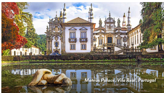
Mateus Palace, Vila Real, Portugal