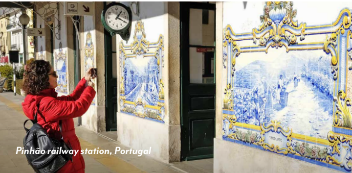
Pinhão railway station, Portugal

The tiles blossomed in popularity and — especially between the 17th and 18th centuries — became Portugal's predominant decorative art form. They can be found adorning palaces, churches, public buildings, staircases, walls and train stations. Their designs portray cultural, religious and historical scenes, mythological tales and stories from literature. They served as a way to educate and enlighten, since books were expensive and not always accessible to average citizens.