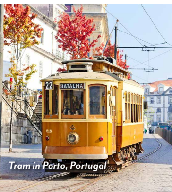
Tram in Porto, Portugal

Following breakfast, disembark and transfer to the airport for your return flight home. (B)