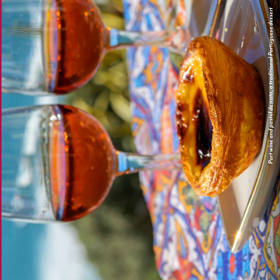
Port wine and pastel de nata, a traditional Portuguese dessert

PRSRT STD U.S. Postage PAID Gohagan & Company