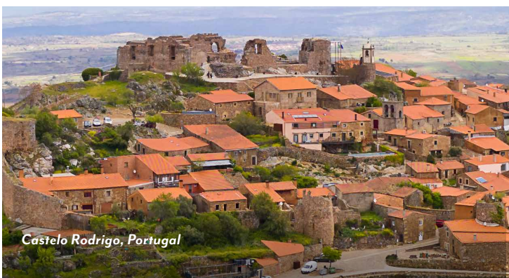
Castelo Rodrigo, Portugal