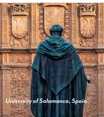
University of Salamanca, Spain

Explore Mateus Palace and Gardens on a guided tour. The Baroque façade is well known, as it is pictured on the Mateus rosé wine label. The palace is brimming with antiques and artwork; the gardens boast formal beds, topiaries and statues; the captivating Cedar Tunnel is an aromatic