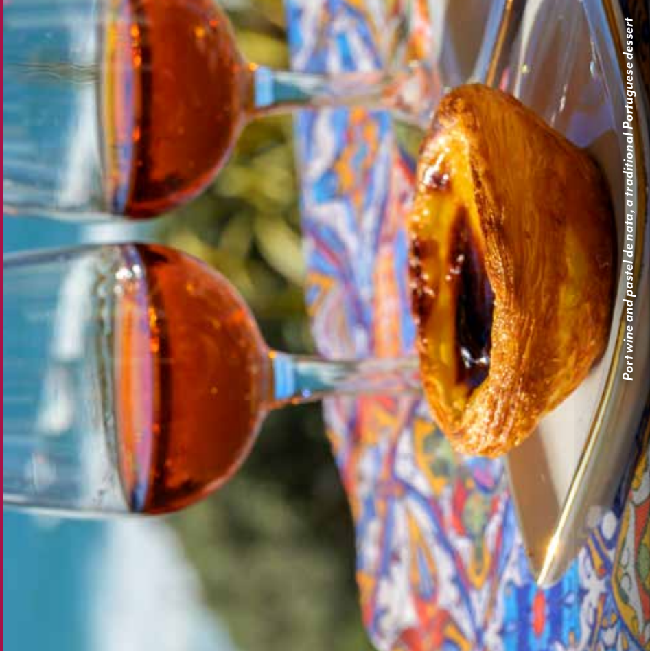
Port wine and pastel de nata, a traditional Portuguese dessert

Early Booking Savings* available | Save $2,000 per couple!