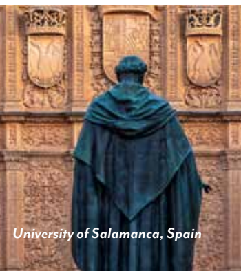
University of Salamanca, Spain

Explore Mateus Palace and Gardens on a guided tour. The Baroque façade is well known, as it is pictured on the Mateus rosé wine label. The palace is brimming with antiques and artwork; the gardens boast formal beds, topiaries and statues; the captivating Cedar Tunnel is an aromatic