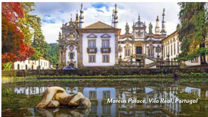
Mateus Palace, Vila Real, Portugal