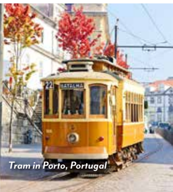
Tram in Porto, Portugal

Following breakfast, disembark and transfer to the airport for your return flight home. (B)