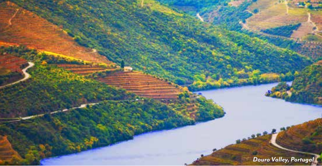
Douro Valley, Portugal