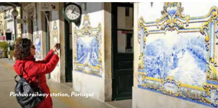
Pinhão railway station, Portugal

The tiles blossomed in popularity and — especially between the 17th and 18th centuries — became Portugal's predominant decorative art form. They can be found adorning palaces, churches, public buildings, staircases, walls and train stations. Their designs portray cultural, religious and historical scenes, mythological tales and stories from literature. They served as a way to educate and enlighten, since books were expensive and not always accessible to average citizens.