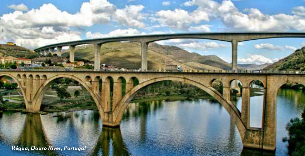
Réguas, Douro River, Portugal

and memorable highlight. After lunch, visit the ancient and picturesque town of Lamego, which produces wines, fruit and smoked meats. Stroll the cobblestoned streets and the town's wide boulevard, lined with cafes and market stalls. Lamego is home to one of the most important pilgrimage sites in Portugal, the Nossa Senhora dos Remédios, set on a spectacular hilltop. The church is accessed by a Baroque double staircase of 686 steps and nine terraces, decorated with statues, azulejos and urns. The views at the top are spectacular! End the day with a tasting of local specialties and wines. (B,L,D)