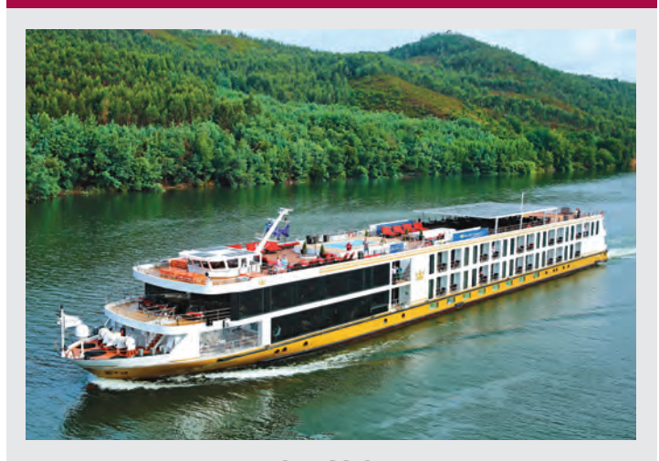
AmaVida Exclusively Chartered, Deluxe River Boat