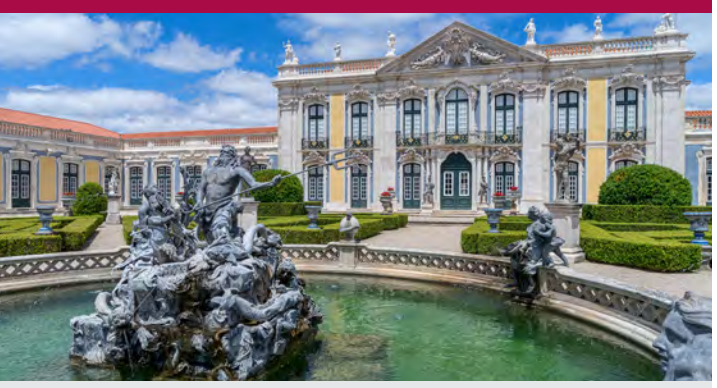
Lisbon | 4 days, 3 nights City Tour | Fado Performance | Queluz Palace