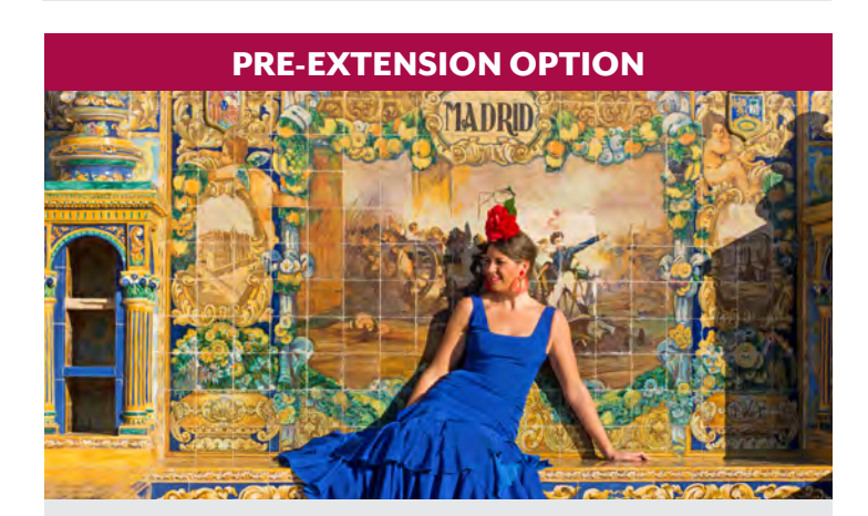
Madrid | 4 days, 3 nights Salamanca, Spain | Madrid City Tour