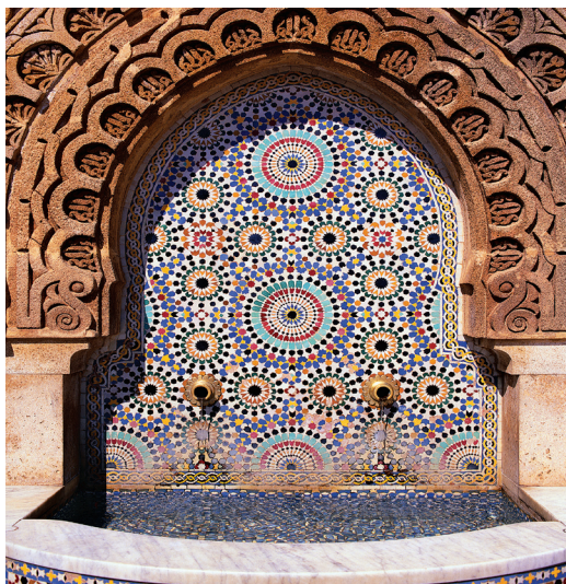
Traditional Moroccan tile work

Day 10: Ouarzazate/Ait ben-Haddou/Marrakech En route to Marrakech today, we stop first at uninhabited Ait ben-Haddou, a UNESCO World Heritage Site and one of southern Morocco’s most scenic villages that is often used as a location for fashion and film shoots. Its old section consists of deep red kasbahs packed together so tightly they appear to be a single unit. Then, as we begin our descent from the High Atlas, we pass through typical villages with fortified walls and stone houses with earthen roofs. In Tizi N’Tichka, we traverse the Pass of the Pastures