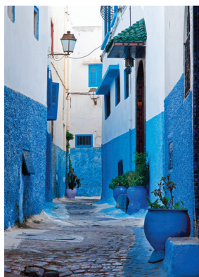
Rabat's Kasbah des Oudaias

Day 11: Marrakech Once the capital of southern Morocco, the imperial city of Marrakech is an alluring oasis with a temperate climate, distinct charm, and fascinating sights. This morning we travel by horse-drawn carriage from Menara Park to Majorelle Gardens, a private botanical garden with some 15 species of birds native to North Africa and known for its cobalt blue accents. Following a tour of the gardens we visit the nearby Yves St. Laurent Museum, housing a vast collection of the designer's haute couture and design works. After lunch at our hotel, mid-afternoon we embark on a walking tour of the medina , ending at Djemaa el Fna Square, a UNESCO World Heritage Site and the heart of Marrakech, crowded with snake charmers, entertainers, storytellers, musicians, barbers, and sellers of fruit, water, and spices. Dinner tonight is on our own in this exotic city. B,L