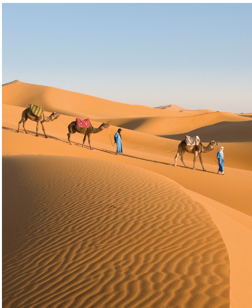
We ride camels in the Sahara.

largest and most cosmopolitan city. After a brief orientation tour of the city, we visit the magnificent Hassan II Mosque, Morocco's only functioning mosque open to non-Muslims. Tonight we celebrate our Moroccan adventure at a farewell dinner at a local restaurant. B,D