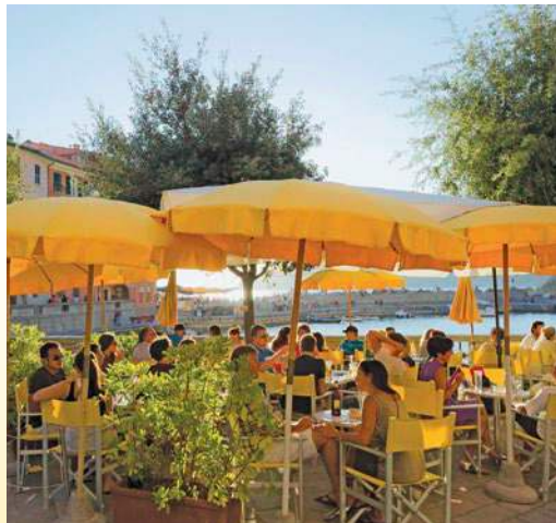
Seaside dining in Vernazza