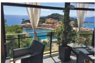
Hotel Vis a Vis | Sestri Levante