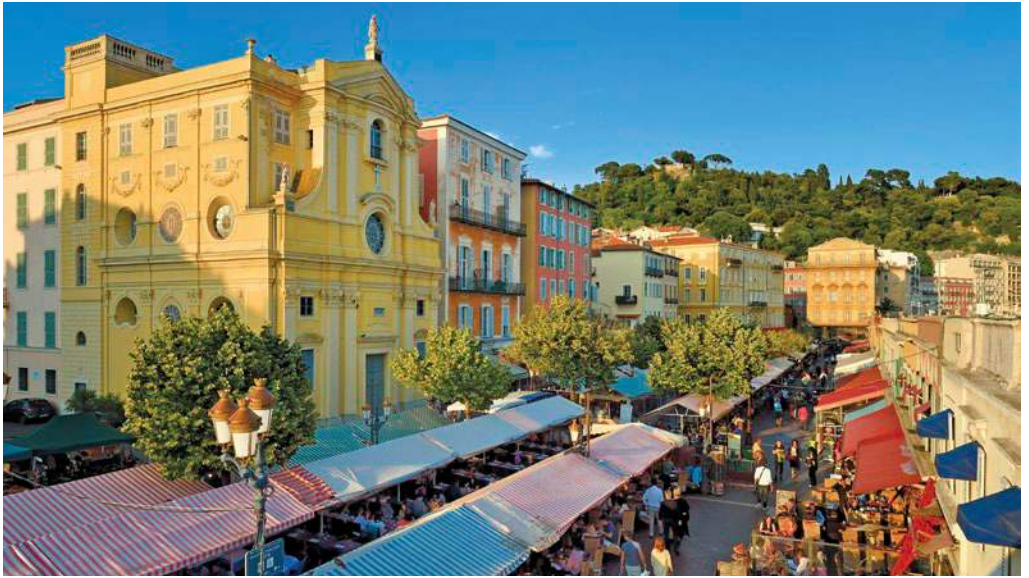
Cours Saleya, Nice