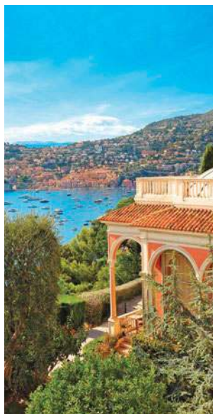
View of the Côte d'Azur from Villa Ephrussi

Knowledgeable Lecturers deepen your appreciation for the region and its history, culture and current events.