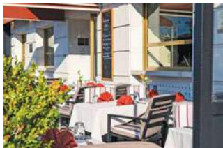
Hotel Aston La Scala | Nice