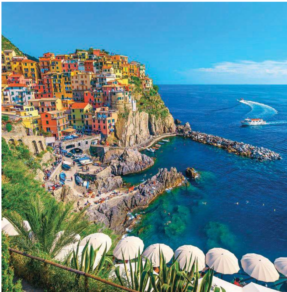
Manarola, Cinque Terre