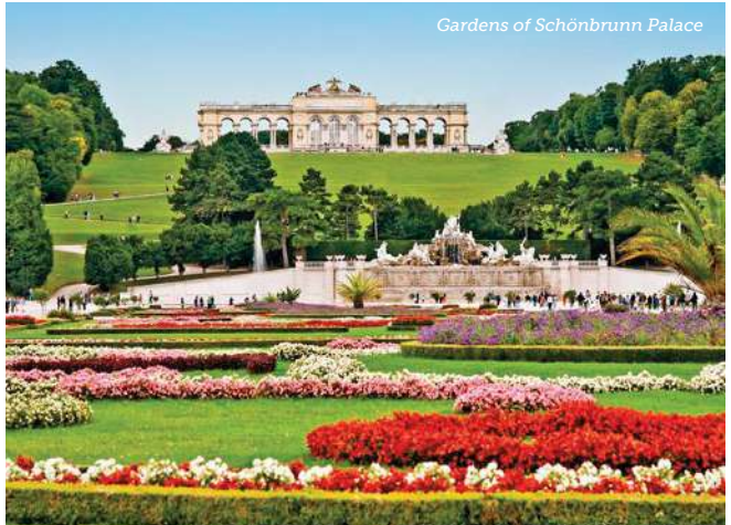
Gardens of Schönbrunn Palace