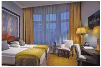
Art Deco Imperial Hotel | Prague, Czech Republic