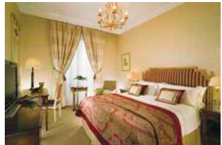
Sofia Hotel Balkan | Sofia, Bulgaria