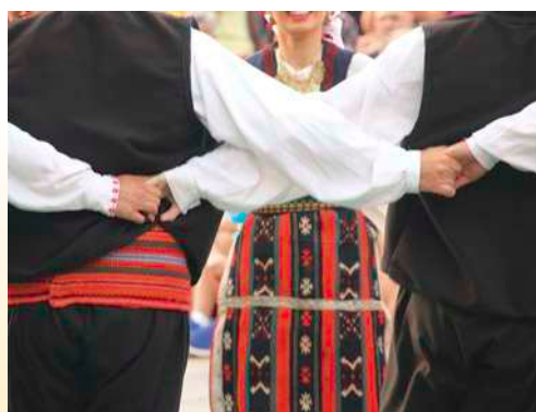
Serbian folk dancing

• Jewish Quarter. Witness Budapest's Great Synagogue, the poignant Shoes on the Danube Bank memorial and other sites.