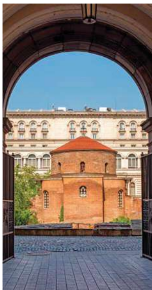
St. George Rotunda, Sofia