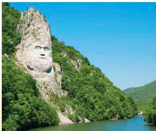
Decebalus stone sculpture, Iron Gate Gorge

• Eat Like a Local. Experience Serbian cuisine. Taste kajmak , a creamy cheese, plus other treats with delicious spices and flavors.