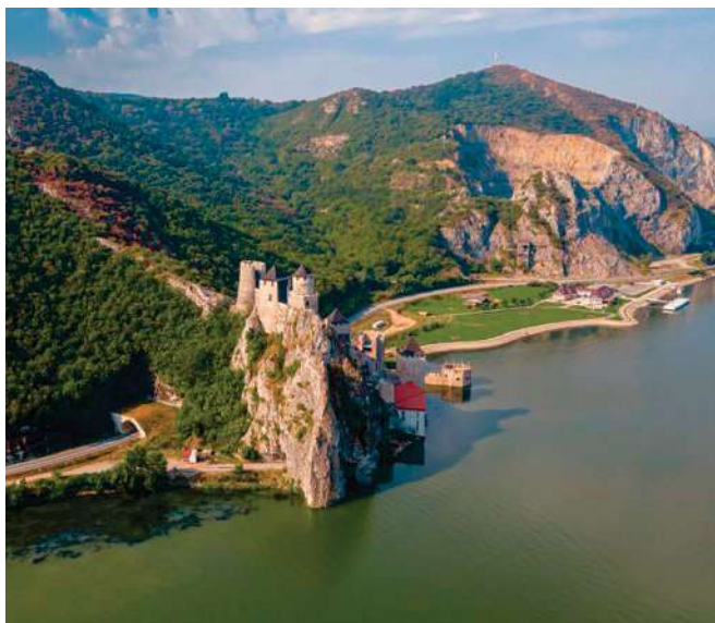
Banks of the Danube, Serbia