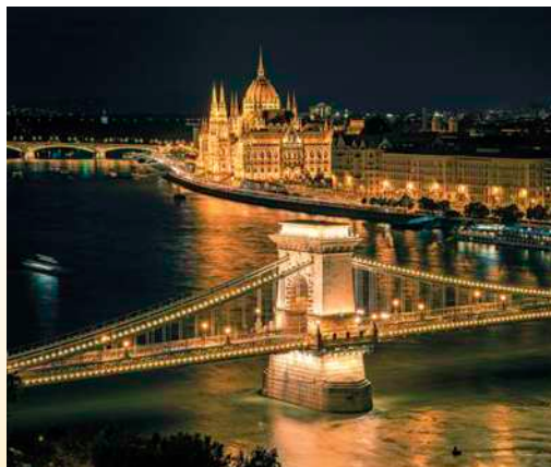
Budapest at night