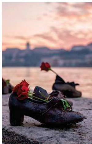
Shoes on the Danube Bank, Budapest