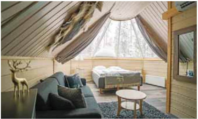
Northern Lights Village | Saariselkä