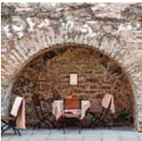
Old Town, Tallinn