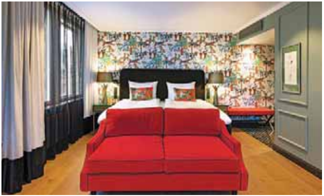
Hotel U14 | Helsinki