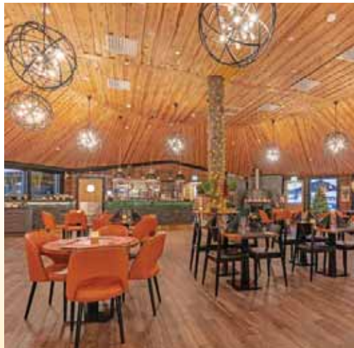
Dining room, Northern Lights Village