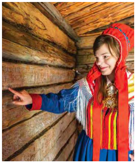
Sámi woman, Sámi Museum Siida

every second night in northern Lapland, weather permitting. Savor a refreshing break by a fire, complemented by toasty beverages, snacks and tales about the Northern Lights.