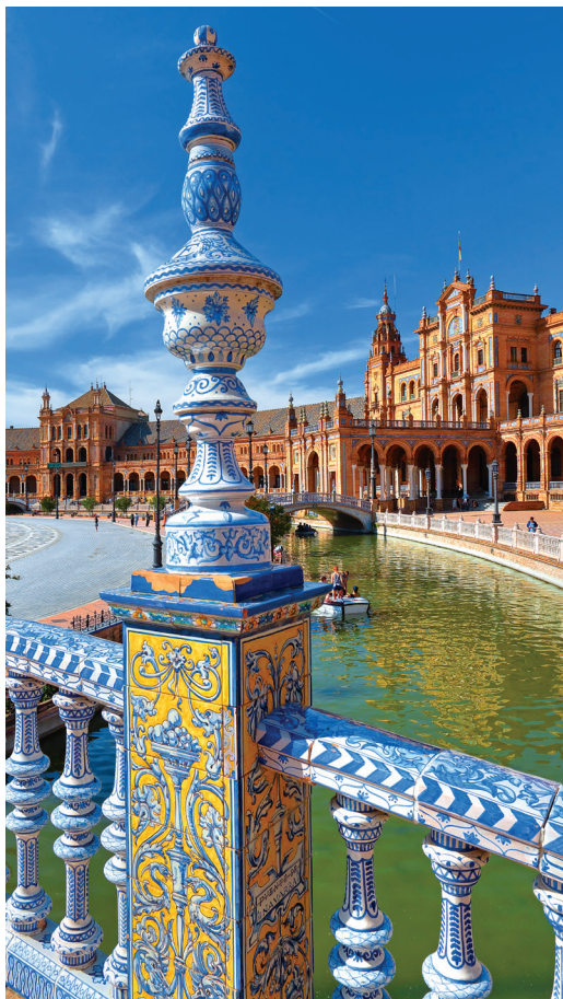
Seville’s colorful Plaza de España