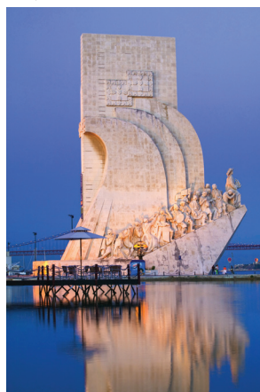
Lisbon’s Monument to the Discoveries

Day 13: Madrid Our morning tour of this monumental and dignified capital city includes vast Plaza Mayor; the Moorish medieval district; and opulent