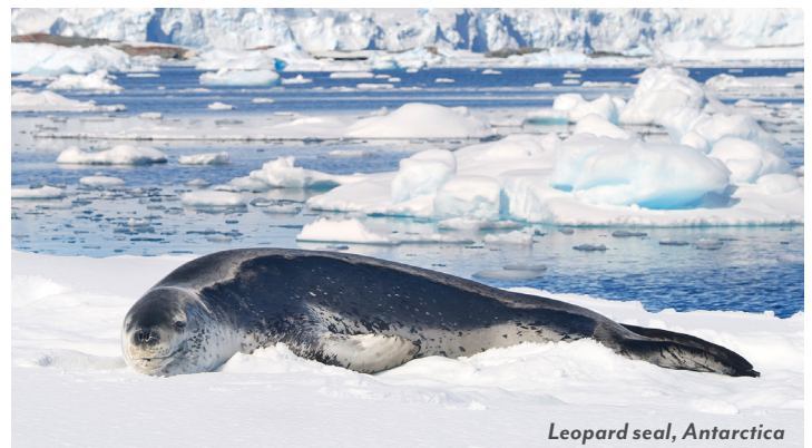
Leopard seal, Antarctica