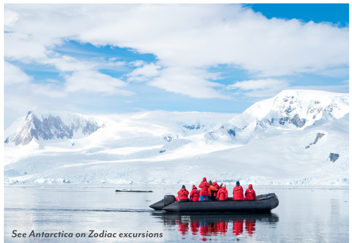
See Antarctica on Zodiac excursions

Iguazú Falls | 4 days, 3 nights Parque das Aves jungle reserve