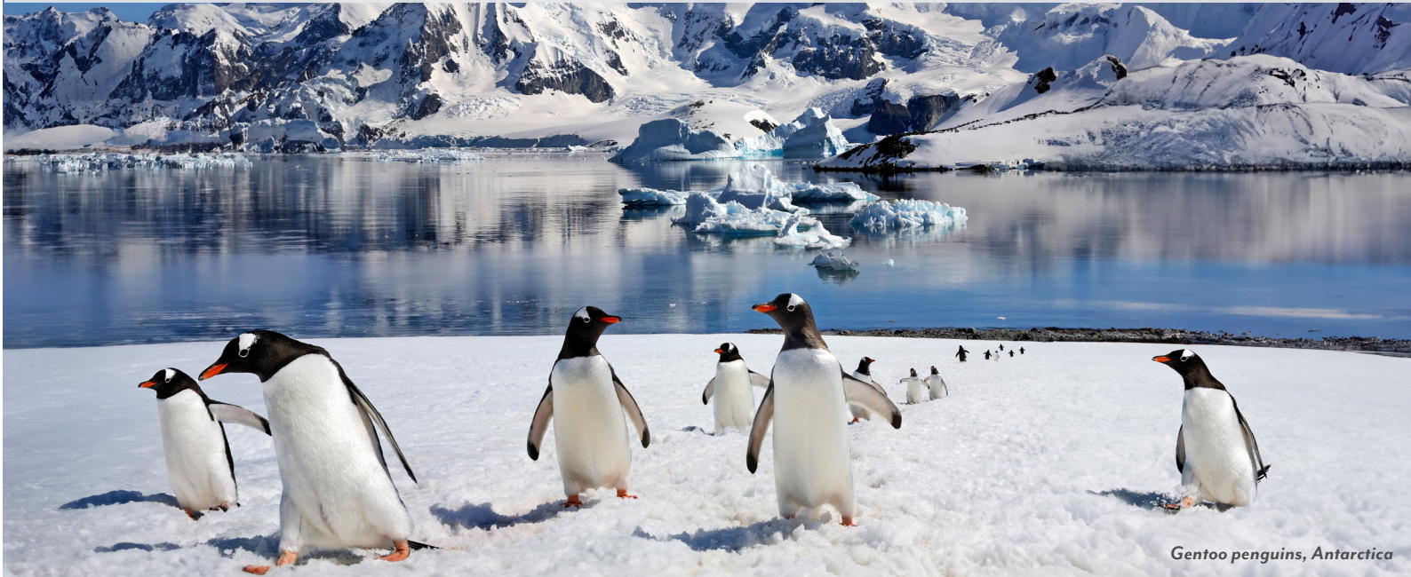
Gentoo penguins, Antarctica