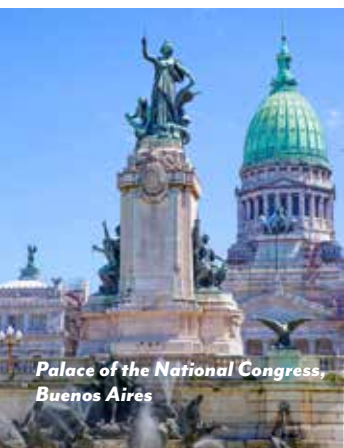
Palace of the National Congress, Buenos Aires

Walk in the footsteps of great explorers on Deception Island, an extinct volcano in the South Shetland chain. Named