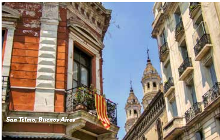
San Telmo, Buenos Aires