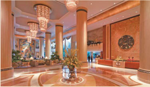
Shangri-La Singapore | Singapore