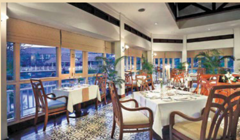
Sofitel Angkor Phokeethra Golf and Spa Resort | Siem Reap