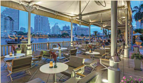
The Peninsula Bangkok | Bangkok