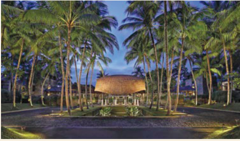
Maya Ubud Resort & Spa | Bali