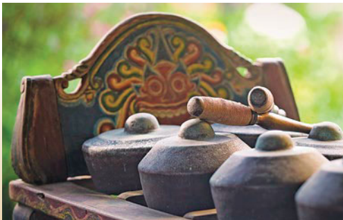
Left: Balinese gamelan | Below: Beaded baskets, market, Ubud

Multicultural Singapore. Uncover Singapore's diverse cultures and rich history. Drive through Kampong Glam, a Malay enclave that originated as a fishing village. Explore Chinatown and Little India's vibrant flower and exotic spice markets.